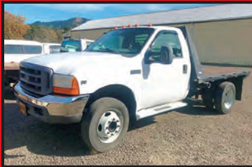
2000 FORD F-450