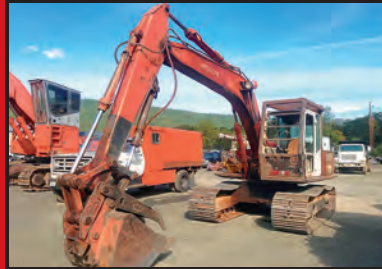
HITACHI FX130 EXCVATOR WITH THUMB