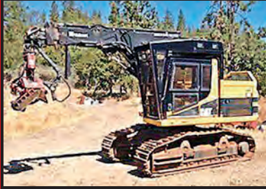
CAT 315 WITH VALMET PROCESSOR