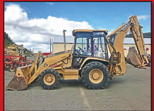
CAT 426C TLB 4X4 AWS