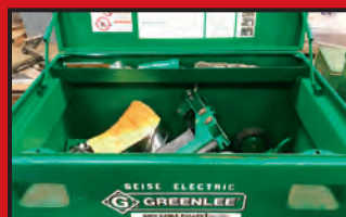
GREENLEE 6000 SUPER TUGGER CABLE PULLER