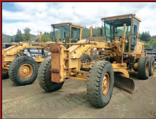
CAT 140G GRADERS