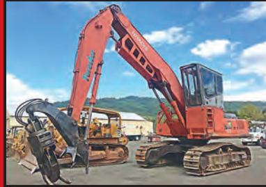
HITACHI EX370 FORESTER