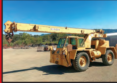
GROVE RT48MC ROUGH TERRAIN CRANE