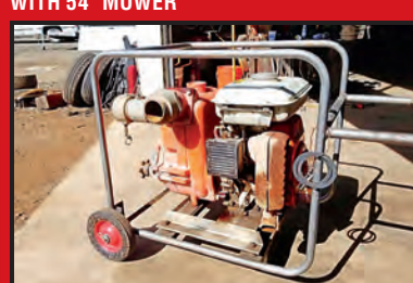
KUBOTA 3" GAS POWERED TRASH PUMPS