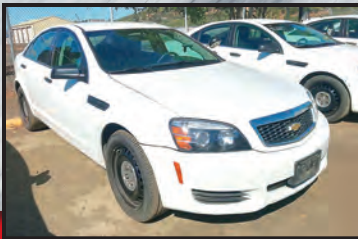
2015 CHEVROLET CAPRICE