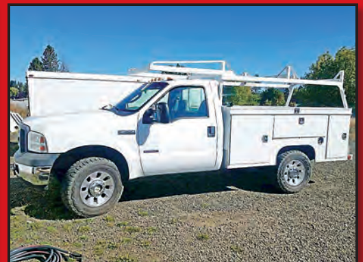
2001 FORD F-350 4X4 DIESEL WITH 9FT UTILITY BOX

No Reserves – All Items Sell to Highest Bidder