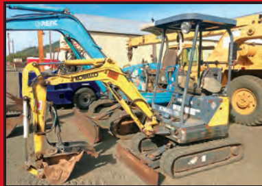
KOBELCO SK135R MINI EXCAVATOR WITH THUMB