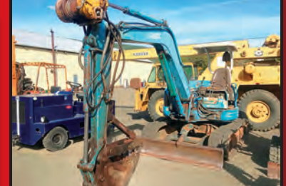
YANMAR V1050 WITH THUMB AND WINCH