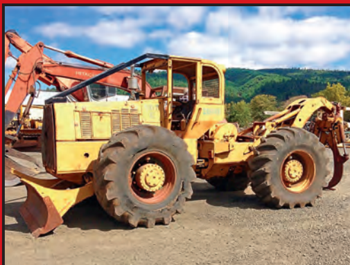
CLARK RANGER MODEL 667C GRAPPLE SKIDDER