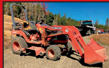
KUBOTA BX2200 4X4 DIESEL TRACTOR WITH 54" MOWER

HOME & GARDEN Assorted Garden Tools. Assorted Plant Pots. Cement Blocks. CRAFTSMAN Electric Chainsaw. CRAFTSMAN Gas Powered Edger Trimmer. Custom Built Aluminum One-Wheeled Burden Carrier. Dog Kennel Panels. DOVRE Gas Heating Stove. DR 3-Pt. Chipper. EBAC Dehumidifier. Gas-Powered Towable Wood Splitter. HUSQVARNA 372XP Chainsaw. HUSQVARNA 440 Chainsaw. HUSQVARNA 55 Chainsaw. HUSQVARNA Chainsaw. JOHN DEERE LA130 Automatic Riding Lawn Tractor with 48" Mower. KELLER 24' Aluminum Extension Ladder. Poly Landscaping Ponds. RUBBERMAID Poly Stock Tank. SOLO Gas-Powered Backpack Sprayer. STIHL 290 Chainsaw. STIHL MS192TC Chainsaw. STIHL MS440 Chainsaw. STIHL MS441C Chainsaw. Stone Veneer. TORRO Electric String Trimmer.