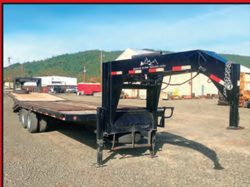
2014 SNAKE RIVER GN TRAILER