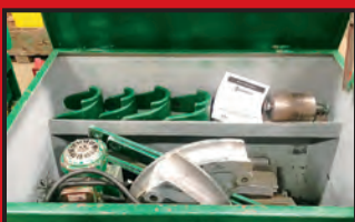
GREENLEE 881 CAM TRACK BENDER

Parts Washer. Pass Load Impulse Utility Framing Nailer. Pedestal Mounted 5" Swivel Base Vise. Pneumatic Lube Pumps and 12V Diesel Transfer Pump. Portable Electric Air Compressor. Porter Cable Portaband Band Saw. Powder Actuated Fasteners by REMINGTON, DUALL FAST and HILTI. POWR-KRAFT 10" Engine Lathe. RAMCO RS90 Horizontal Metal Cutting Band Saw. REALIST David-White Transit with Tripod. REGENT 8070T Hydraulic Pipe Squeezers. Rigid Conduit Bender. Rigid Model 700 Pipe Threader with Dies. Sandblast Cabinet. SENCO DS300 AC Duraspin Screw Gun. SHENKUNG UFO90 Dust Collector. Spin Shop 12' Lathe. Spin Shop Buffer. Tail Off Stands. Tank Mounted Electric Air Compressor. Vacuum Pump. WILTON 7" Bench Grinder. Wood Turning Chisels.