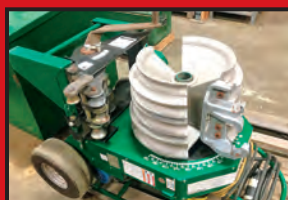
GREENLEE 853 QUAD BENDER