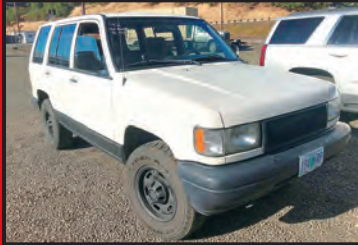
1992 ISUZU TROOPER