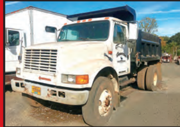
1990 INTERNATIONAL 4900 5-YARD DUMP TRUCK