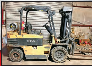
DAEWOO G30S-2 6000LB WITH SIDE SHIFT