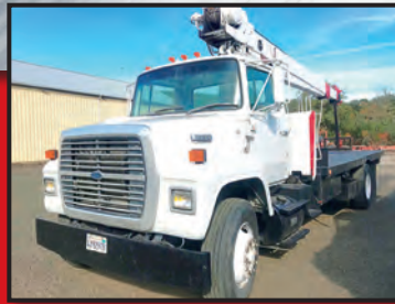
1996 FORD L8000 DIESEL WITH CRANE

2006 12' Enclosed Trailer. 2014 SNAKE RIVER CO. 24' 20k Tandem Dually Flatbed Trailer with Beavertail and Ramps. Beam / Log Dolly. MILLER Log Trailer with Truck Bunks. WHITLOG Model SA100 Log Trailer with Truck Bunks.