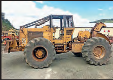
CAT 518 SKIDDER