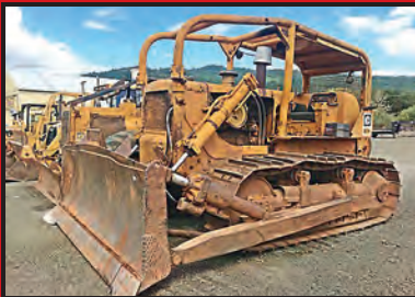
CAT D7E WITH WINCH