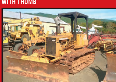
KOMATSU D21P DOZER