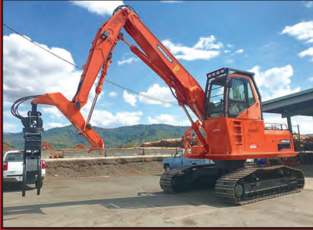
DOOSAN SOLAR 225 LL LOG LOADER

Heavy Equipment, Trucks, Trailers, Vehicles, Farm Equipment, Tools & More!