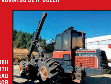
VALMET 546H WOODSTAR WITH DANGLEHEAD PROCESSOR