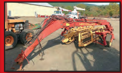
NEW HOLLAND UNITIZED 216 HAY RAKE