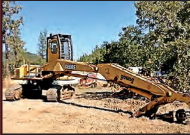
JOHN DEERE 270LC LOG LOADER