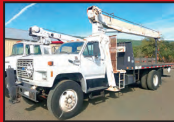
1990 FORD F-800 DIESEL WITH NATIONAL MODEL 400A CRANE