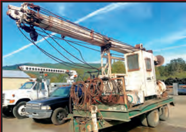
CHRISTY TRAILER MOUNTED YARDER