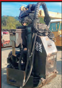
DENHARCO DHT550 PROCESSOR