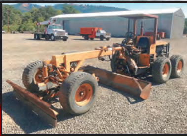
BASIC 601B ARTICULATING GRADER