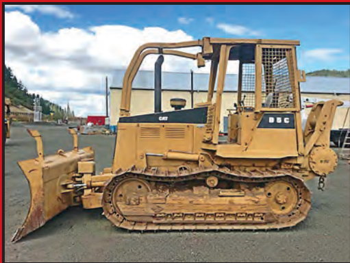
CAT D5C DOZER WITH WINCH

Heavy Equipment, Trucks, Trailers, Vehicles, Farm Equipment, Tools & More!