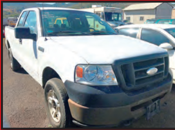
2006 FORD F-150