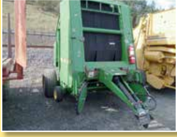
JOHN DEERE 435 ROUND BALER