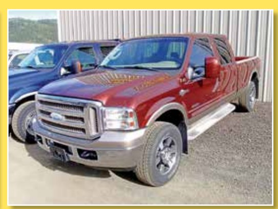
2006 FORD F-350 KING RANCH 4X4 DIESEL