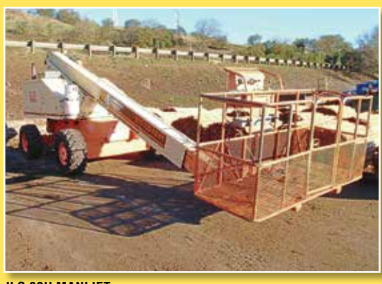
JLG 60H MANLIFT