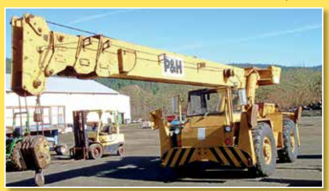
P&H R180 RT HYDRAULIC CRANE

All Day Preview: Saturday, March 10 from 9:00 A.M. to 5:00 P.M. & 2 Hours Prior to the Sale on Sunday