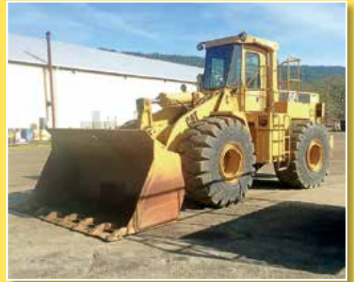
CATERPILLAR 966F FRONT END LOADER

Heavy Equipment, Trucks, Trailers, Vehicles, Farm Equipment, Tools & More