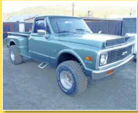
1971 CHEVY C10 4X4

No Reserves – All Items Sell to Highest Bidder