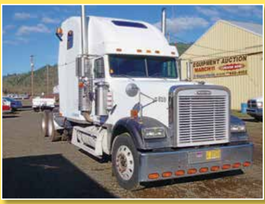
2000 FREIGHTLINER WITH DOUBLE SLEEPER