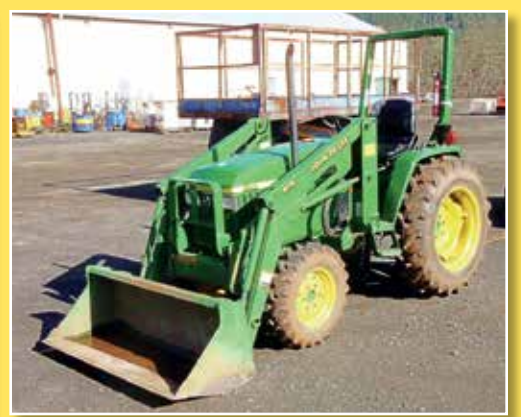
JOHN DEERE 790 DIESEL 4X4 TRACTOR