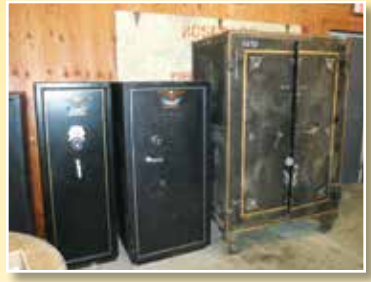
GUN AND BANK SAFES