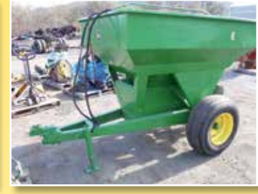
JOHN DEERE 602 SPREADER