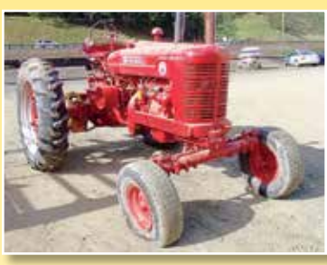
FARMALL SUPER M TRACTOR