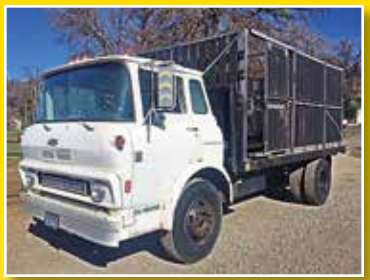
1974 CHVROLET FLATBED CATTLE TRUCK

with 7.5 hp Mercury outboard, seats, oars, cover and trailer.