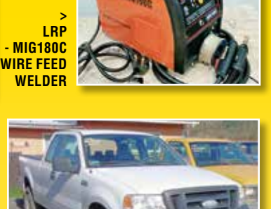
2006 FORD F-150 XL 4X4