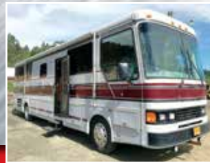
1989 MALLARD OVERLAND 38' DIESEL PUSHER