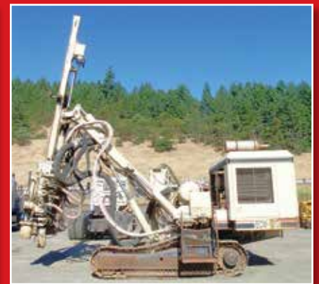
INGERSOLL RAND ECM-370 ROCK DRILL

No Reserves – All Items Sell to Highest Bidder