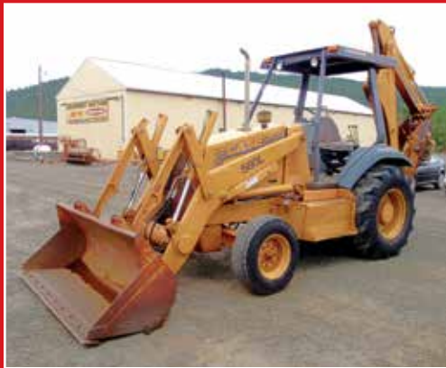
CASE 580L TRACTOR LOADER BACKHOE

Heavy Equipment, Trucks, Trailers, Vehicles, Farm Equipment, Tools & More!