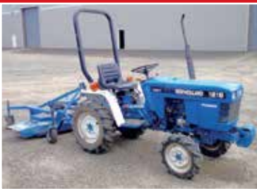
NEW HOLLAND 1215 4X4 DIESEL TRACTOR