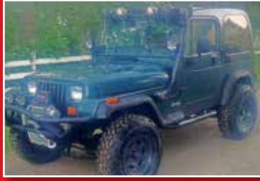
1994 JEEP WRANGLER SAHARA 4X4