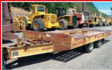
EAGER BEAVER TILT-DECK TRAILER