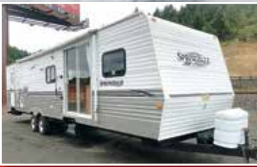
2008 SPRINGDALE 37' TRAILER WITH SLIDES