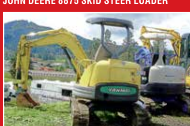
YANMAR V10 30-3 MINI EXCAVATOR