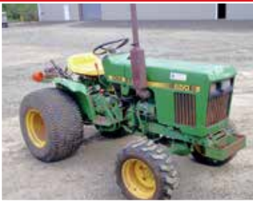
JOHN DEERE 650 4X4 DIESEL TRACTOR