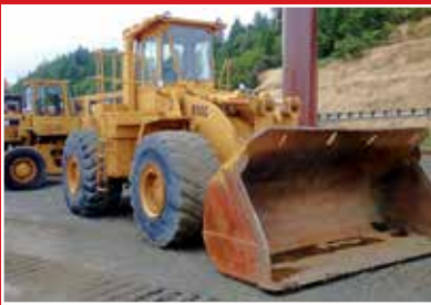
CAT 980C FRONT-END LOADER