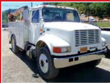
2000 INTERNATIONAL 470 SERVICE TRUCK WITH HOIST AND OUTRIGGERS