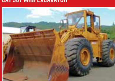
(1 OF 2) CAT 980B FRONT-END LOADERS