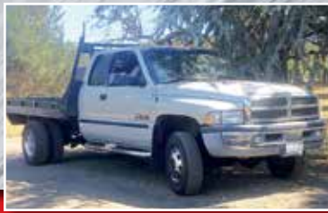
2000 DODGE RAM 3500