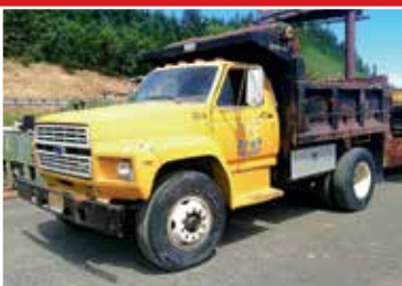
1989 FORD F-800 5-YARD DUMP TRUCK WITH LOAD TARP