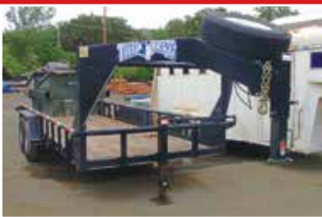
TEXAS BRAGG 20' GOOSENECK TRAILER WITH RAMPS