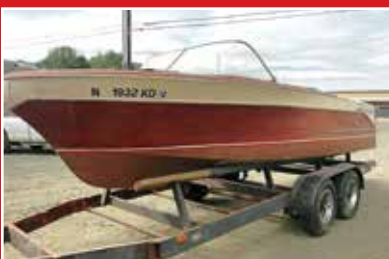
1957 CHRIS CRAFT 21' BOAT