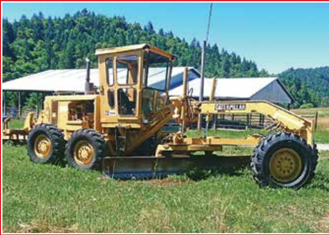
CAT 140G GRADER

Heavy Equipment, Trucks, Trailers, Vehicles, Farm Equipment, Tools & More!