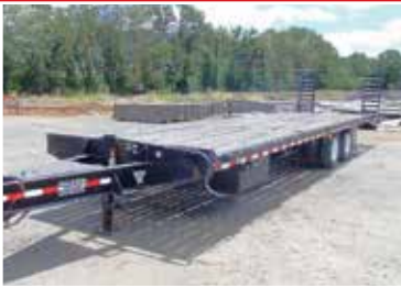
2006 ROLLS RITE 30' FLATBED TRAILER