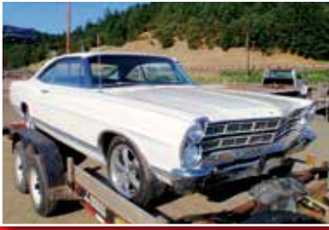
1967 FORD GALAXIE 500