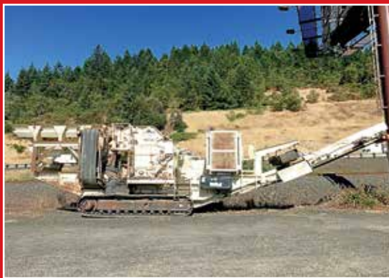
TEREX CEDAR RAPIDS COBRATRACK 1300 CRUSHER