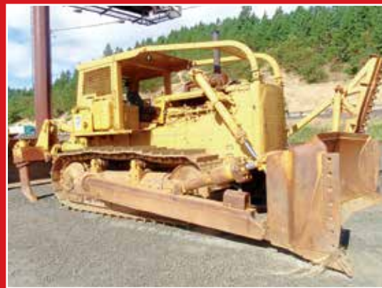
CAT D8K DOZER WITH RIPPERS AND SLOPE BOARD