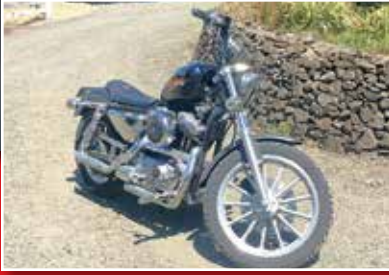
1997 HARLEY DAVIDSON 1200

New items added regularly between now and auction day.