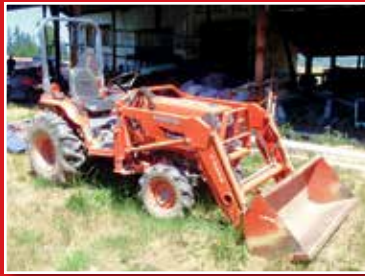
KUBOTA B7800 HSD 4X4 DIESEL WITH LOADER