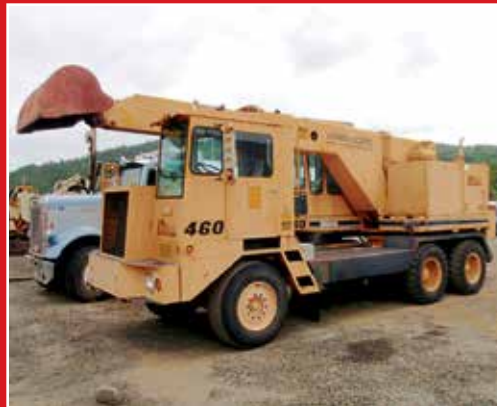
BADGER 460 HYDROSCOPIC WHEELED EXCAVATOR