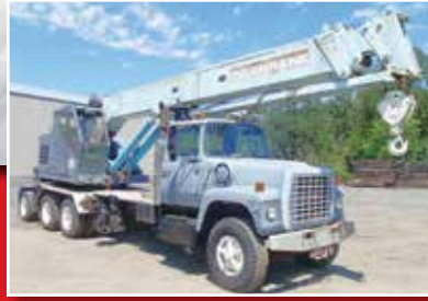
1983 FORD 9000 WITH BANTAM 450 TELECRANE CRANE