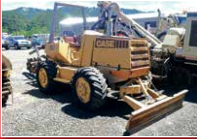
CASE 760 TRENCHER