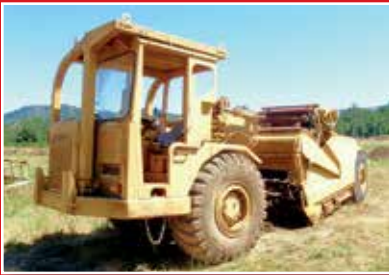
CAT 613 PADDLE SCRAPER