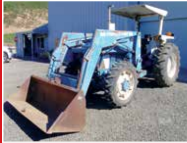
FORD 3910 4X4 TRACTOR WITH FRONT-END LOADER