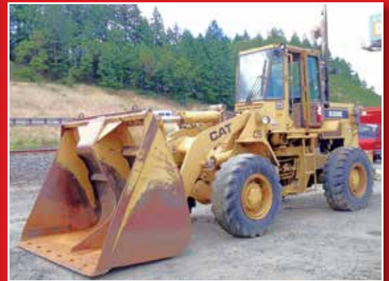
CAT 936E FRONT-END LOADER