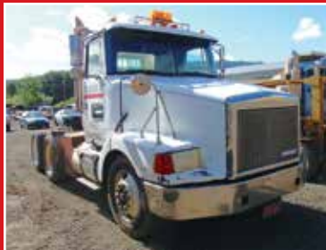
1993 WHITE GMC 6' X 4' WITH WET KIT