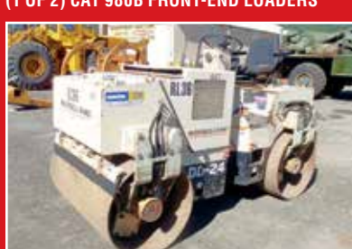
INGERSOLL RAND DD24 ROLLER