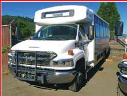
2007 CHEVROLET C5500 DURAMAX DIESEL TRANSIT BUS