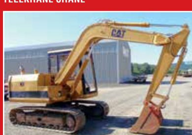
CAT 307 MINI EXCAVATOR