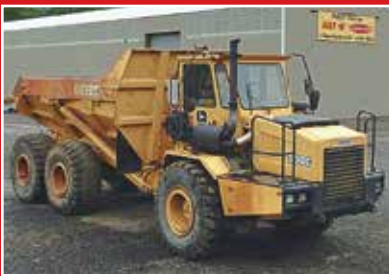
JOHN DEERE 300C DUMP TRUCK