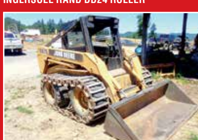
JOHN DEERE 8875 SKID STEER LOADER