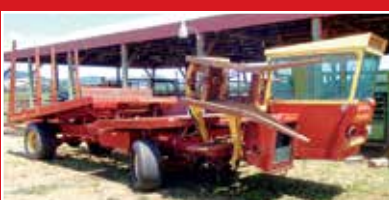
NEW HOLLAND 1048 STACKCRUISER