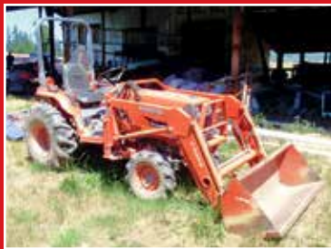
KUBOTA B7800 HSD 4X4 DIESEL WITH LOADER