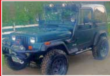
1994 JEEP WRANGLER SAHARA 4X4