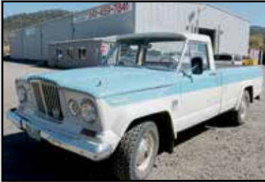
1968 JEEP J3000 4X4—LOW MILES!