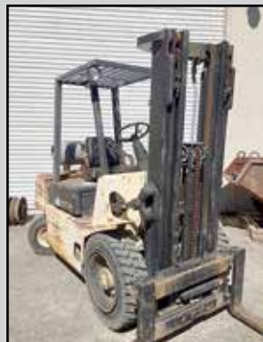
HYSTER H50XL FORKLIFT