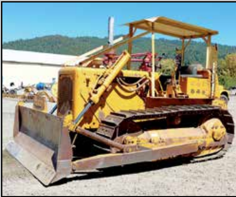
CATERPILLAR D4D DOZER WITH HYSTER WINCH

Heavy Equipment, Trucks, Trailers, Vehicles, Farm Equipment, Machine Shop, Tools & More