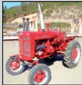
INTERNATIONAL MCCORMICK FARMALL 100 TRACTOR