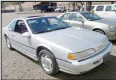
1992 THUNDERBIRD SUPER COUPE — LOW MILES!