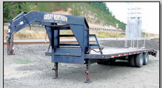
2006 GREAT NORTHERN 25' TANDEM DUALY FLATBED

No Reserves – All Items Sell to Highest Bidder