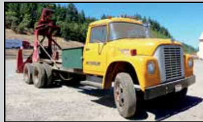
INTERNATIONAL LOADSTAR 1800 3-AXLE TRUCK WITH RAMEY HYDRAULIC LOADER