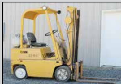
CLARK C500 FORKLIFT

No Reserves – All Items Sell to Highest Bidder