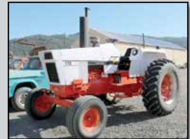
CASE 970 TRACTOR

Woodworking Tools Incl. Joiners, Lathes, Clamps, Bits, Woodturning Chisels, Routers, Radial Arm Saws, Cutoff Saws Incl. CRAFTSMAN, MAKITA, RYOBI, DEWALT, DELTA and More.