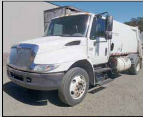
2003 INTERNATIONAL 4300 GARBAGE TRUCK