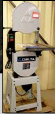
< DELTA 14" VERTICAL BANDSAW