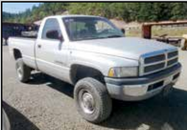
2001 DODGE RAM 2500 4X4