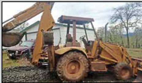
CASE 590 4X4 WITH EXTENDAHOE