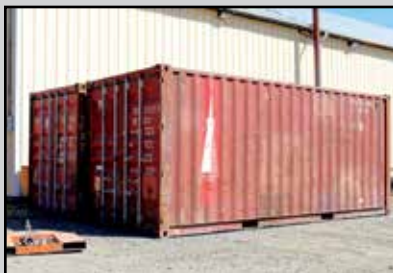
(2) 20' SHIPPING CONTAINERS