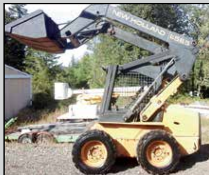
NEW HOLLAND LX565 SKID STEER LOADER