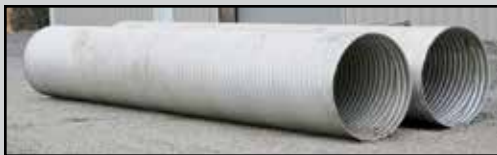
36" X 20' GALVANIZED CULVERTS