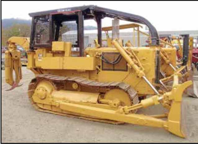
CATERPILLAR D4D DOZER WITH GRAPPLE

Heavy Equipment, Trucks, Trailers, Vehicles, Farm Equipment, Machine Shop, Tools & More