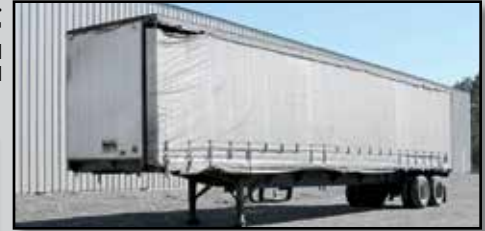
> 48' CURTAIN VAN