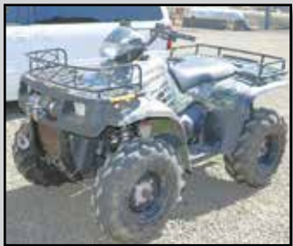
2003 POLARIS SPORTSMAN 700 4X4

12" Traffic Signals – NEW. 20' Electric Tote/Cart Conveyor. (2) 20' Shipping Containers. (2) 40' Shipping Containers. 500-Gallon Overhead Fuel Tank, with stand. Assorted Chains and Binders. Assorted Hardware Bins and Cabinets, with contents and more. Assorted Pallet Jacks. Assorted Propane and Kerosene Space Heaters. Assorted Tail Blocks. Assorted Truck Parts – Incl. Airbags, Rear Ends, Hydraulic Lift Gates, Front Bumpers, Hitches and More. Balance Beam Scales. Chainlink Fencing. Chainlink Fencing Panels. (2) Cone-Bottom Vertical Hoppers, with stands. Fabric Collapsible 3,000-Gallon Potable Water Tanks. FLEXIBLE FLYER Wagon. FOODMACHINE Commercial Mixer, with bowl and attachments. HARBOR 8' Utility Truck Box. HAVAHART Live Animal Traps. HOBART Vertical Meat Cutting Bandsaw. Industrial Electric Motors and Pumps. Industrial Metal Shelving. (2) KAR PRODUCTS Bolt Bins, with contents. KARCHER Electric Pressure Washer. KATO 15 KVA Diesel Generator. KNAPHEIDE 9' Utility Truck Box. LANDA Pressure Washer/Steam Cleaner. Maple Burl Turning Stock. Mechanical Rocking Horse with Vintage MAYTAG Engine. Pallet Racking. PRENTICE Hydraulic Cardboard Baler. Radio Flyer and Flexible Flyer Tricycles. Soda Vending Machines. Soil Testing Equipment. Vintage Forge. Vintage Fuel Pump. Vintage School Desk. Warehouse Carts. Wire Decking. And More!