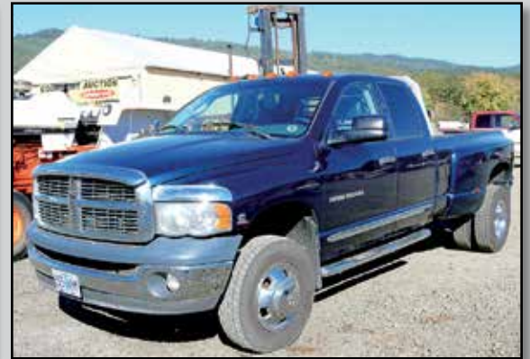
2004 DODGE RAM 3500 4X4