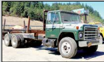
INTERNATIONAL S1900 3-AXLE DIESEL TRUCK WITH LOG BUNKS