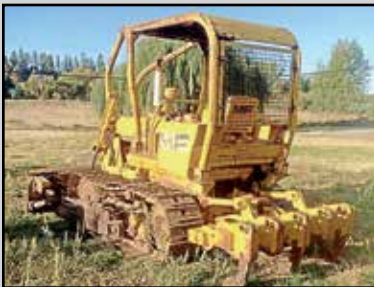
MASSEY FERGUSON 300 DOZER WITH 6-WAY BLADE AND RIPPERS