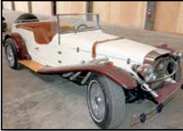
1929 MERCEDES KIT CAR