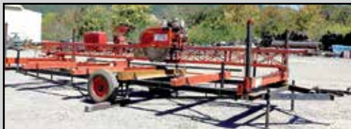
MOBILE DIMENSION MODEL 20-26 PORTABLE SAWMILL