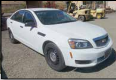
2012 CHEVROLET CAPRICE POLICE CAR