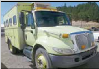
2003 INTERNATIONAL 4300 CREW HAULER