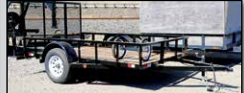
NEW GLIDE HS BUILT UTILITY TRAILER