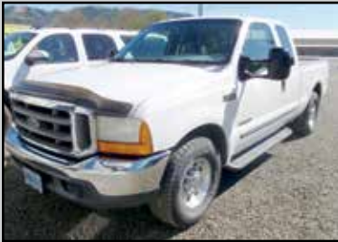
1999 FORD F-250 XLT DIESEL