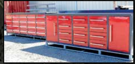
> (2) 9' TOOL CHESTS WITH STEEL TOP — NEW