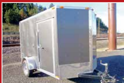
CONTINENTAL 10' ENCLOSED TRAILER