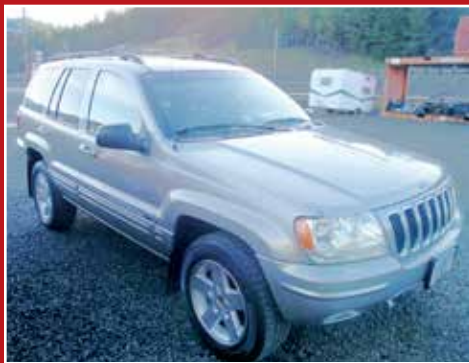
2001 JEEP GRAND CHEROKEE