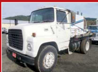
1977 FORD F-700 WITH FIRE TANK, PUMP AND HOSE REEL