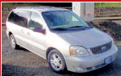
2005 FORD FREESTAR SEL