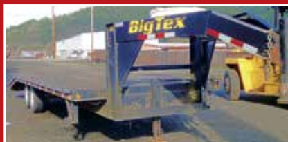
BIG TEX 14GN 25FT EQUIPMENT TRAILER