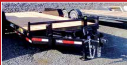
(2) GREAT NORTHERN 14K 20' SUPER-TILT TRAILERS