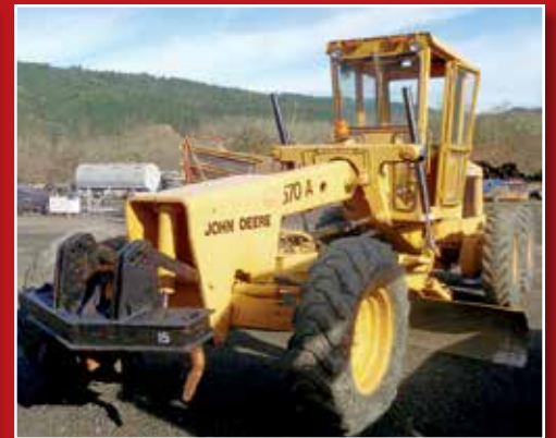
JOHN DEERE 570 GRADER