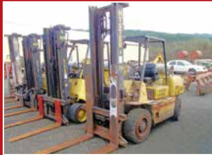
HYSTER H4.00XL5 8,000-LB. PROPANE FORKLIFT WITH SIDE SHIFT