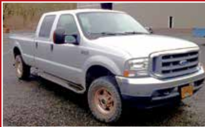
2004 FORD F-250 SUPER DUTY 4X4 DIESEL

AIRCO and VICTOR Track Burners, Track Burner Tracks and Pattern Burners. CENTURY 230-Amp AC Welder. ESAB Mig-Master 250 Wire Feed Welder. HOBART Tig-Weld AC/DC Welder. HYPER-THERM Max40 Plasma Cutter. LINCOLN AC 225-Amp Welder. LINCOLN Idealarc 250 AC/DC Welder. LINCOLN Idealarc SP250 Wire Feed Welder. (2) MILLER 250 Twin Welding Power Sources. MILLER Max-Star 150STL Portable Wire Feed Welder with Gas Bottle and Regulator. (2) MILLER Millermatic 200 Wire Feed Welders. Oxy-Acetylene Sets Incl. Carts, Bottles, Regulators, Hand-Pieces and Hoses. VICTOR Oxy-Acetylene Hand-Pieces, Regulators, Torch Heads and Welding Tips. And More!