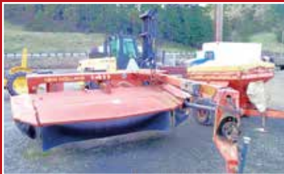
NEW HOLLAND 1411 DISCBINE MOWER CONDITIONER