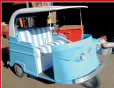
1961 TAYLOR-DUNN TRIDENT MICRO CAR