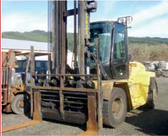
HYSTER H250HD 25,000-LB. CAPACITY WITH CUMMINS DIESEL, SIDE SHIFT AND FORK POSITIONER

Heavy Equipment, Trucks, Trailers, Vehicles, Farm Equipment, Machine Shop, Tools & More