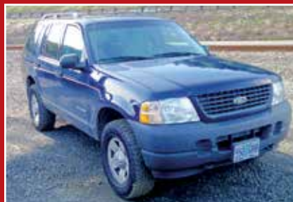
2004 FORD EXPLORER