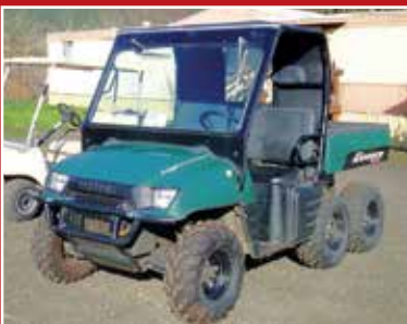
2007 POLARIS RANGER 6X6