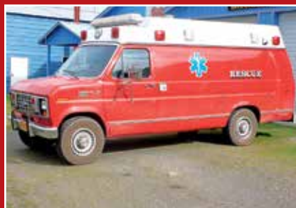
1986 FORD E-350 AMBULANCE

RANKIN 3-Point 5' Rotary Cutter. Sheep and Goat Squeeze Chute. UNITED FARM TOOLS Pull-Behind Gas-Powered Fertilizer Spreader. Unused POWDER RIVER 14' Galvanized Water Trough. WESTFIELD Grain Auger. And More!