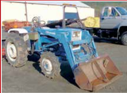
FORD 1900 TRACTOR