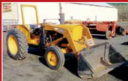
JOHN DEERE 401 TRACTOR