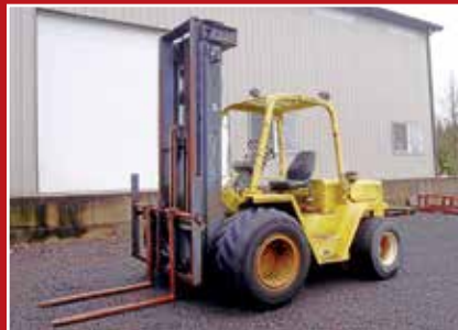
1996 EAGLE PICHER RC60 FORKLIFT