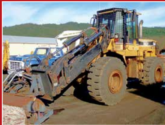
CATERPILLAR 950F FRONT-END LOADER