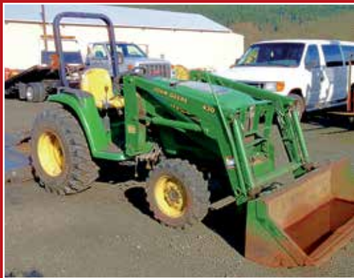
JOHN DEERE 4300

Heavy Equipment, Trucks, Trailers, Vehicles, Farm Equipment, Machine Shop, Tools & More