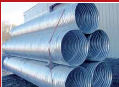
NEW 36" CORRUGATED CULVERT