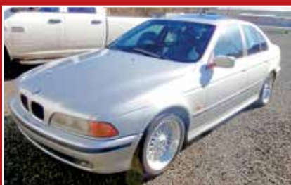
1999 BMW 528I