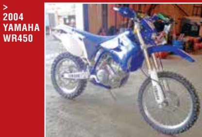
> 2004 YAMAHA WR450