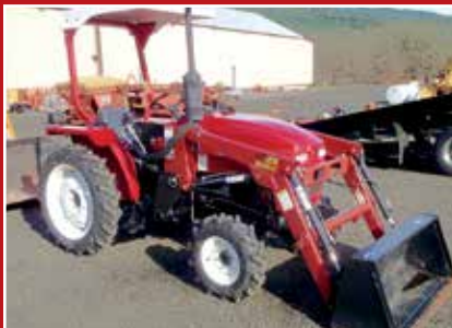
NORTRAC NT204C TRACTOR