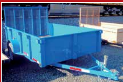
GREAT NORTHERN LS1060 6' X 10' UTILITY TRAILER