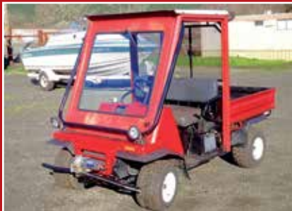
1997 KAWASAKI MULE

Gas Powered Cultivator. Gas Powered Leaf Blower. Gas Powered Post Hole Auger. Gas Powered String Trimmers. GOLDEN WEST BILLIARDS Custom Pool Table with Accessories. Landscaping Rocks. Lawn and Garden Tractor Trailer. Live Animal Traps. Meat Slicer. NEW Picnic Table. NEW Toilets. OUTBACK Gas Powered Walk-Behind Rotary Mower. POULAN 21" Gas Powered Lawn Mower. Safes. Under Counter Refrigerators. YARD MACHINES 10 HP Gas Powered Chipper/Shredder. And More!