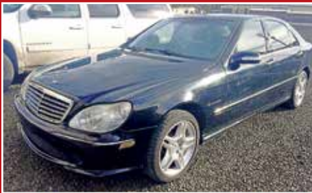
2003 MERCEDES S55AMG SEDAN