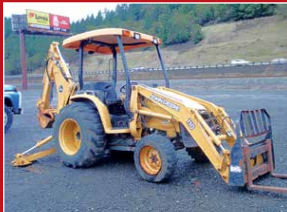
JOHN DEERE 110