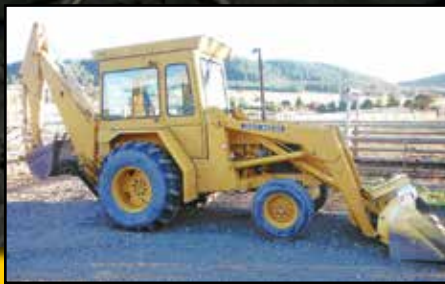
JOHN DEERE 410D TRACTOR LOADER BACKHOE