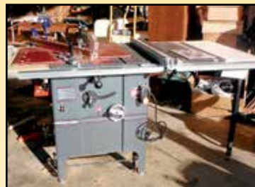
SHOPSMITH 2000 TABLE SAW WITH BIESMEYER FENCE