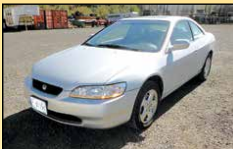
2000 HONDA ACCORD