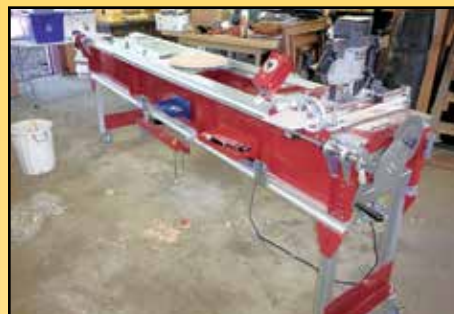
LEGACY ORNAMENTAL MILL