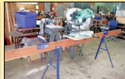
HITACHI 10" COMPOUND MITER SAW WITH TROJAN STAND