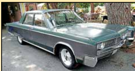
1966 CHRYSLER NEWPORT