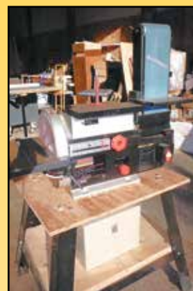
CRAFTSMAN BELT, DISC SPINDLE SANDER