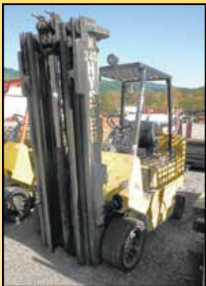
(1 OF 2) HYSTER S80 XL2 BCS 8,000-LB LP FORKLIFTS