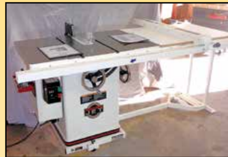
JET 10" TABLE SAW WITH XACTA FENCE AND EXTENSION