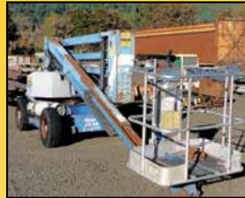
GENIE Z45-22 LPG