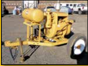
WISCONSIN POWERED 4" WATER PUMP