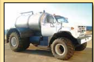
1978 FERTILIZER TRUCK