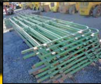
POWDER RIVER 16' LIVESTOCK PANELS