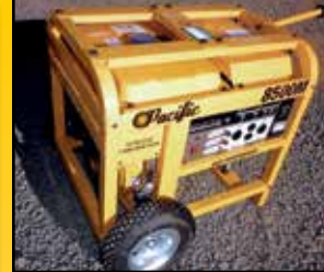
PACIFIC 8500M GENERATOR