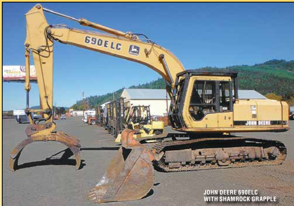
JOHN DEERE 690ELC WITH SHAMROCK GRAPPLE