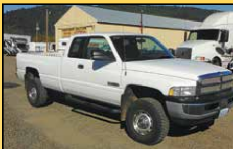
2002 DODGE EXT. CAB 4X4 DIESEL

2000 HONDA Accord. 2002 FORD Taurus. 2004 DODGE Intrepid. 1966 CHRYSLER Newport. 1999 FORD Taurus. 2010 FORD Crown Victoria. 2008 FORD Crown Victoria. 2008 FORD Crown Victoria Police Interceptor.