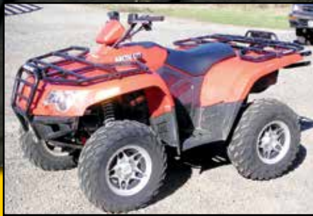
2007 ARCTIC CAT