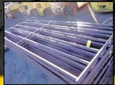
PRIEFERT 12' LIVESTOCK PANELS