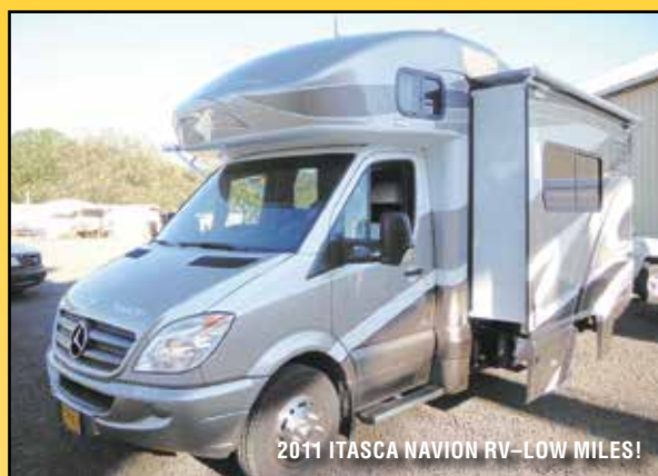
2011 ITASCA NAVION RV—LOW MILES!