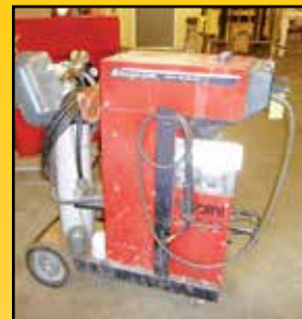
SNAP-ON YA240A MIG WELDER