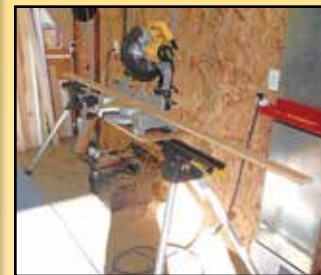
DEWALT 12" COMPOUND MITER SAW WITH DEWALT STAND