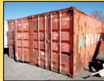
(1 OF 2) 20' SHIPPING CONTAINERS

BIRO Meat Saw. KEENE ENGINEERING Portable Gold Dredge. Antique Chest with Vintage Accordion. Antique Cash Register. Vintage Wooden Rocking Horse. Electric Power Sewer Snake. MIKASA Gas-Powered Jumping Jack Compactor. AIRCO Trailer Mounted Portable Gas Welder. Assorted Rope. Assorted Tail Blocks. Lot of Dryer Rolls. Geofabric Rolls. Personal Lockers. Tractor Tires/Wheels. Assorted Fire Hose. DODGE Transmissions and Transfer Cases. Step Ladders.