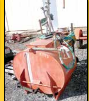
PAK TANK 3-POINT SPRAYER