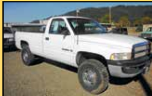
1996 DODGE RAM 2500 4X4