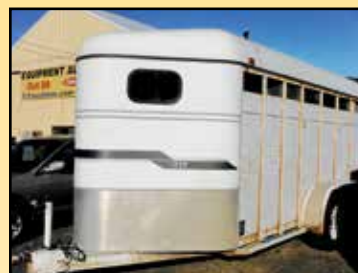
1997 MORGAN BUILT 3H BUMPER PULL WITH TACK ROOM