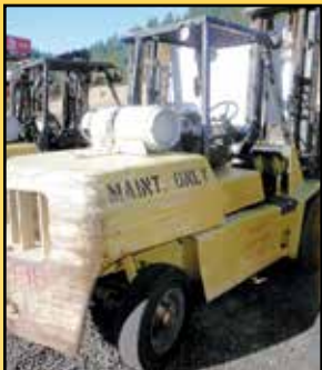
HYSTER H5.00 XL 10,000-LB LP