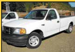
(1 OF 2) 2004 FORD F-150

BRIDGEPORT Mill. DO ALL Surface Grinder. SOUTHBEND Lathe. SNAP-ON YA240A Mig Welder and Accessories. MILLER Plasma Cutter. Sand Blasting Pot. AIRCO Gas-Powered Trailer Mounted Welder. ROCKWELL/DELTA Drill Press. POWR-QUIP 6 HP Air Compressor. PACIFIC EQUIPMENT PAC-2T Gas-Powered Air Compressor. GANTRY Crane with Chain Fall and Trolley. JIB Crane with 1/2-Ton Electric Hoist. WISCONSIN Powered Portable Air Compressor. ZEP Parts Washing Cabinet. Rotary Storage Bin. JUST RIGHT Flammable Liquid Storage Cabinet. CUT-A-LINE Oxy-Acetylene Track Burner. ORBIT Bench Top Drill Press.