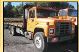
1984 INTERNATIONAL S1900