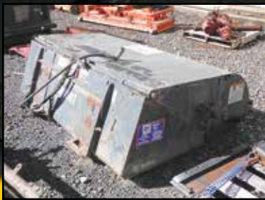
BOBCAT SWEEPER ATTACHMENT