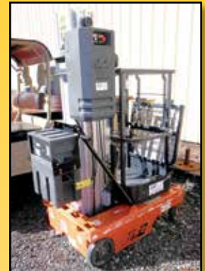
JLG 12-SP ELECTRIC STOCK PICKER