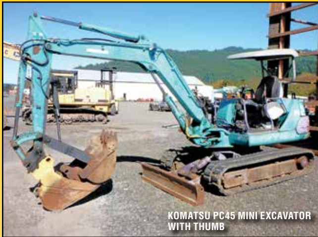
KOMATSU PC45 MINI EXCAVATOR WITH THUMB

Heavy Equipment, Trucks, Trailers, Vehicles, Farm Equipment, Woodworking Tools, Shop Tools & More