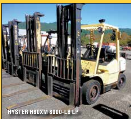
HYSTER H80XM 8000-LB LP