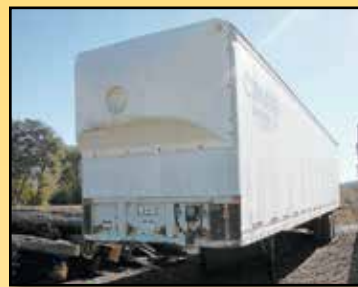
48' FRUEHAUF VAN TRAILER