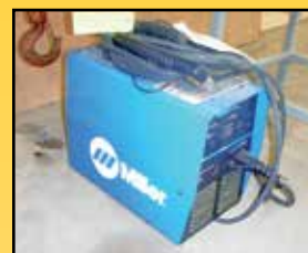
MILLER PLASMA CUTTER