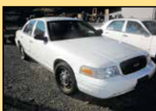
2010 FORD CROWN VICTORIA