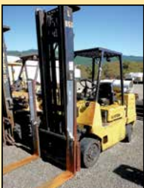
(1 OF 2) HYSTER S80 XL 8,000-LB LP FORKLIFTS