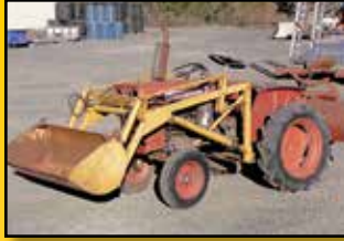
MITSUBISHI R1500 TRACTOR LOADER WITH TILLER