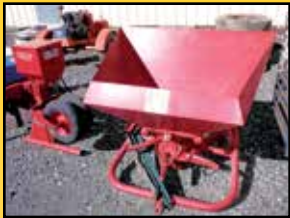
3-POINT BROADCAST FERTILIZER SPREADER