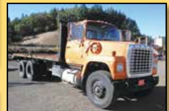
1979 FORD 9000