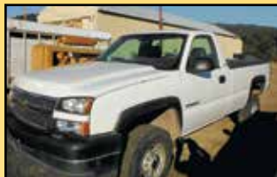
2005 CHEVOLET 2500