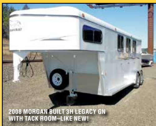
2008 MORGAN BUILT 3H LEGACY GN WITH TACK ROOM—LIKE NEW!

Heavy Equipment, Trucks, Trailers, Vehicles, Farm Equipment, Woodworking Tools, Shop Tools & More