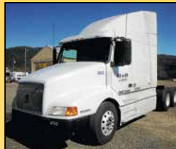
2000 VOLVO VN