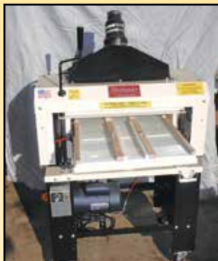
WOODMASTER 6 X 24 PLANER-SHAPER

ROGERS Tank Mounted Air Compressor. Bead Blast Cabinet. Assorted Oxy-Acetylene Torch Carts. Assorted Hydraulic Bottle Jacks/Floor Jacks and Jack Stands. Assorted Bench Grinders. Wood and Steel Top Work Benches. Assorted Measuring Equipment, End Mills and Bits. Assorted Vices and More.