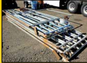
GALVANIZED LIVESTOCK ROUND PEN WITH GATE