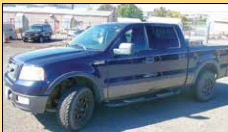
2004 FORD F-150 QUAD CAB