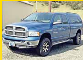
2005 DODGE SLT RAM 3500 4X4 DIESEL