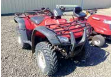
2006 HONDA RANCHER ES TRX 350 4X4