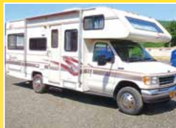
1995 JAMBOREE SEARCHER 23' MOTORHOME