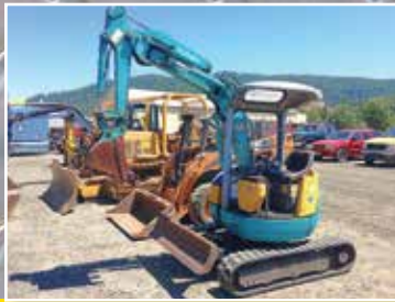
KUBOTA RX202 MINI EXCAVATOR

No Reserves – All Items Sell to Highest Bidder