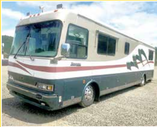
1998 BEAVER MOTOR COACHES 40' MARQUIS TOURMALINE MOTORHOME