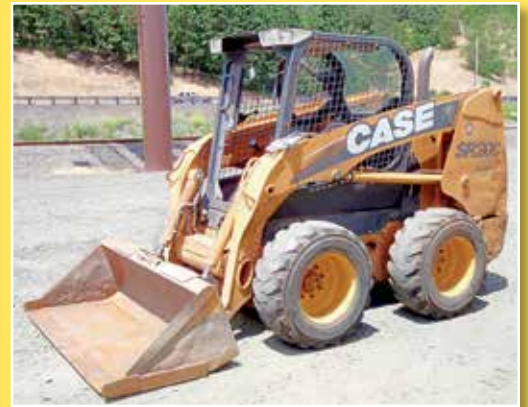
CASE SR200 SKIDSTEER LOADER