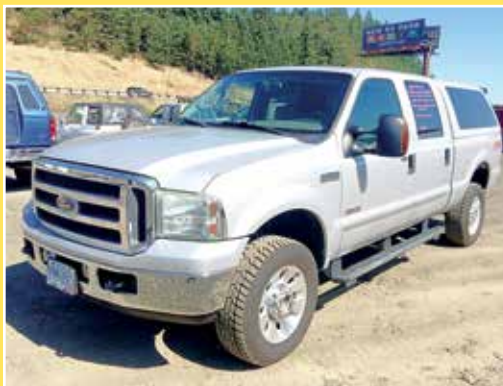
2005 FORD F-350 LARIAT 4X4 DIESEL