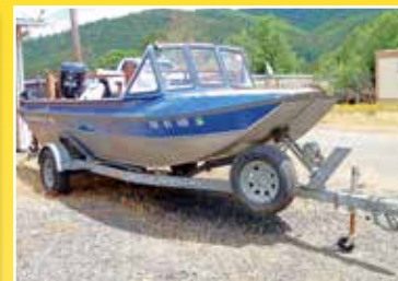
ALUMAWELD 18' WITH OUTBOARD MOTOR AND TRAILER