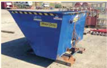
TIP HOPPER FORKLIFT ATTACHMENT

No Reserves – All Items Sell to Highest Bidder