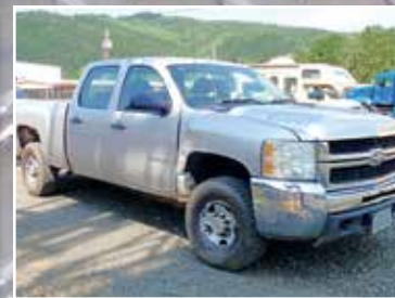
2008 CHEVROLET 2500 HD DIESEL 4X4