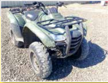
2013 HONDA RANCHER TRX 420 4X4

2013 HONDA Rancher TRX 420 4x4. 2006 HONDA Rancher ES TRX 350 4x4. 2003 HONDA Rancher TRX 350 4x4. 1999 HONDA Fourtrax TRX 300 4x4. 1998 HONDA Foreman ES TRX 450 4x4.