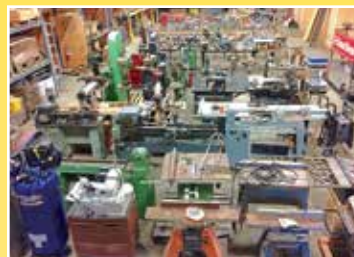
SHOP TOOLS AND EQUIPMENT