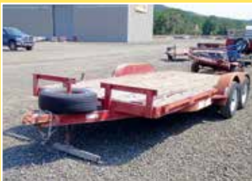
ROAD BOSS 16' EQUIPMENT TRAILER