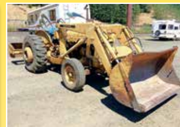
FORD 4500 TRACTOR LOADER SCRAPER