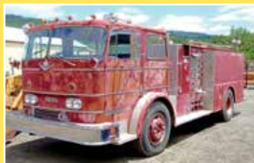
1969 IH HOWE FIRE TRUCK