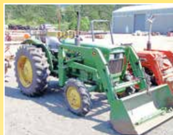
JOHN DEERE 1050 DIESEL 4X4 WITH QA FRONT END LOADER