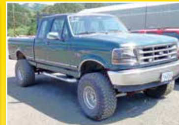
1993 FORD F-150 XLT 4X4