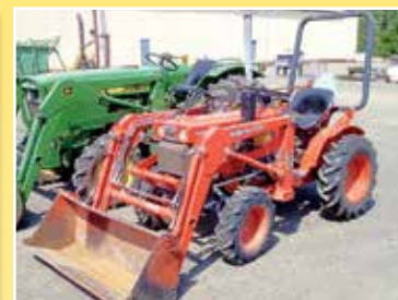
KUBOTA B7100 HST DIESEL 4X4

Steel Saw Horses. SWEED Banding Chopper. Swivel Base Vises. Table Saws. Tail Blocks and Block and Tackle Sets. Torch Carts, Tank Carts, Hand Trucks and Carts. Vintage Blacksmith Anvil. Wet Tile Saws. Wood Lathe and Dovetail Jig.