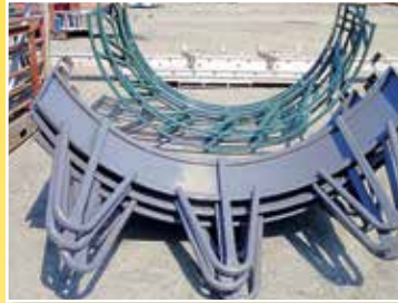
NEW ROUND BALE FEEDERS