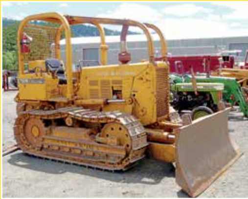
INTERNATIONAL TD8 DOZER

Heavy Equipment, Trucks, Trailers, Vehicles, Farm Equipment, Tools & More!