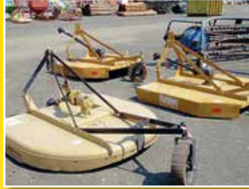
3-PT. ROTARY CUTTERS