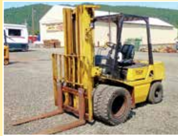
TCM FG30 6,000-LB. GAS FORKLIFT