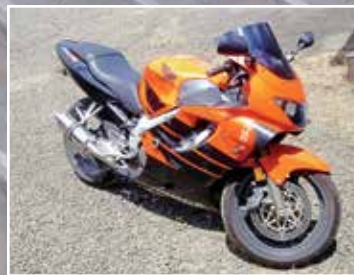
2000 HONDA CBR600 F4