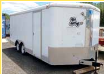
INTERSTATE WEST 20' ENCLOSED TRAILER