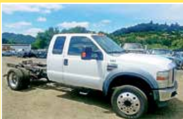
2009 FORD F-550 DIESEL