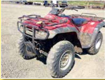
2003 HONDA RANCHER TRX 350 4X4