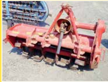
KRONE RE125 4.5' 3-PT. ROTOTILLER