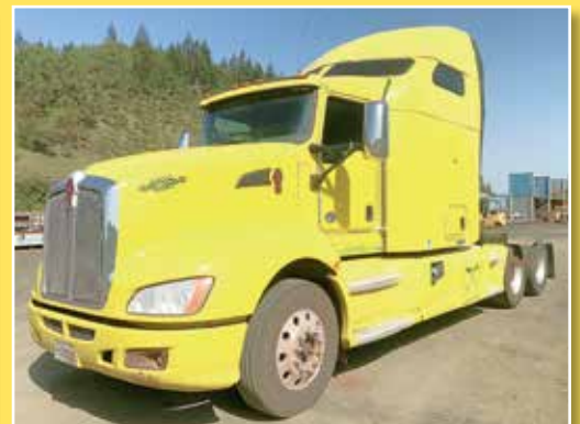
2011 KENWORTH T660 6X4 WITH AEROCAB SLEEPER

No Reserves – All Items Sell to Highest Bidder