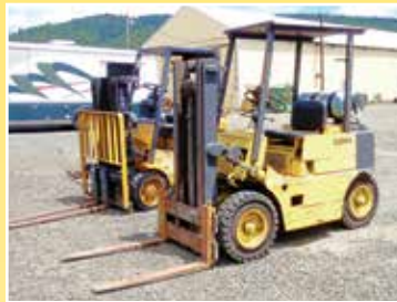
CLARK CY40B 4,000-LB. PROPANE FORKLIFT