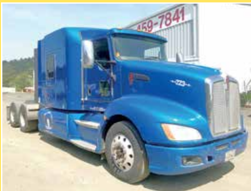
2014 KENWORTH T660 6X4 WITH AEROCAB SLEEPER