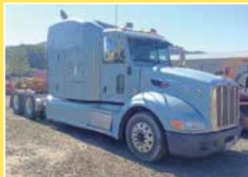
2010 PETERBILT 386 6X4 WITH UNIBILT SLEEPER