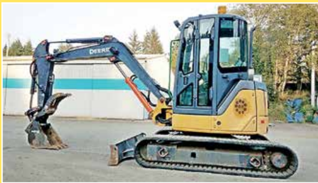
JOHN DEERE 50D MINI EXCAVATOR

Heavy Equipment, Trucks, Trailers, Vehicles, Farm Equipment, Tools & More!