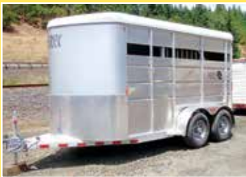
2013 MAVERICK BY SRTC 2-HORSE SLANT-LOAD WITH TACK ROOM