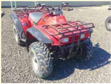
1999 HONDA FOURTRAX 300 4X4