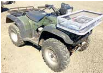
1998 HONDA FOREMAN ES TRX 450 4X4