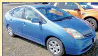
2006 TOYOTA PRIUS