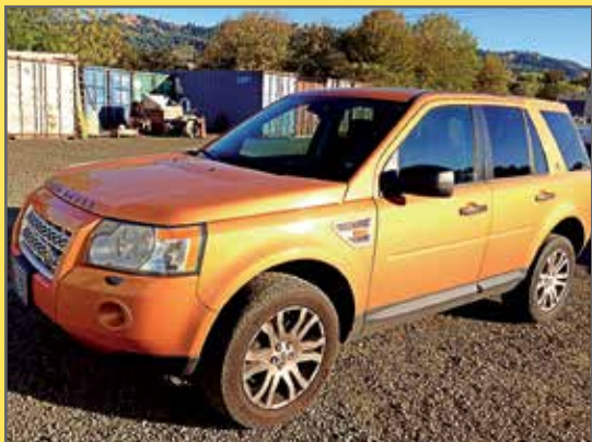
2008 LAND ROVER LR2