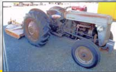
FERGUSON 35 TRACTOR