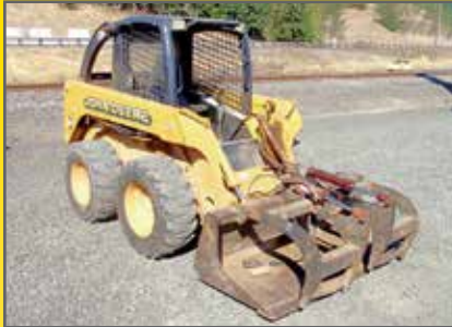
JOHN DEERE 240 SKIDSTEER