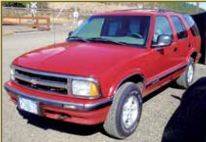
1997 CHEVROLET BLAZER