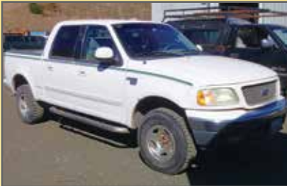
2002 FORD F-150 XLT CREW CAB 4X4