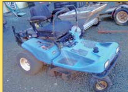
DIXON ZTR 4516K MOWER