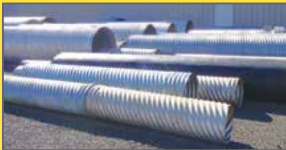
ASSORTED GALVANIZED CULVERT