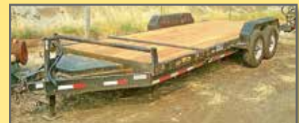
GREAT NORTHERN SUPER TILT TRAILER