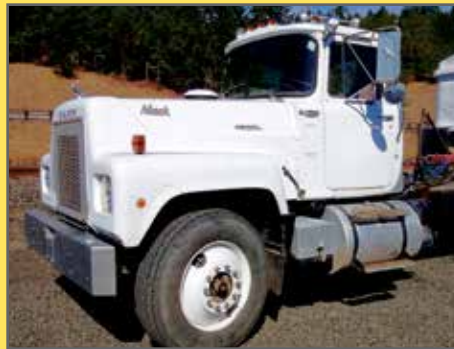
1977 MACK RS700L WITH WET KIT – ORIGINAL MILES!