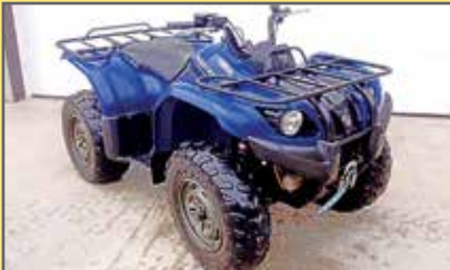
2006 YAMAHA KODIAK YFM450 WITH WARN WINCH