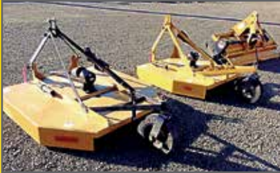
ROTARY CUTTERS AND TILLER