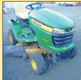
< JOHN DEERE X300 RIDING LAWN TRACTOR WITH 42" MOWER