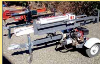
ASSORTED WOOD SPLITTERS