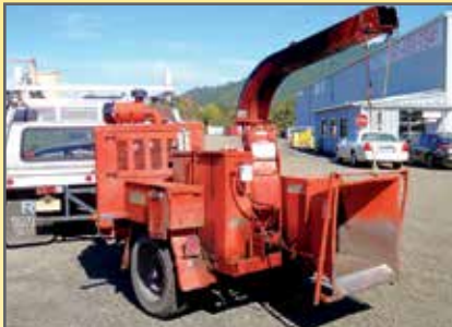
MORBARK 290 CHIPPER