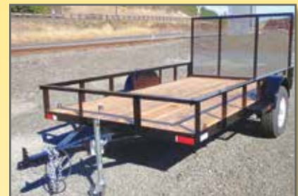
NEW 6X12 GLIDE HS BUILT TRAILER