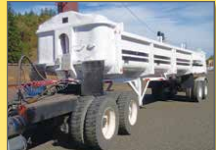
CLEMENT 32FT END DUMP WITH HIGH LIFT GATE