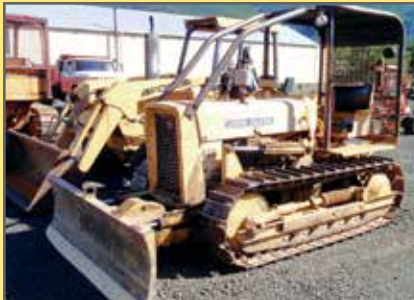
JOHN DEERE 440 DOZER WITH 6-WAY BLADE