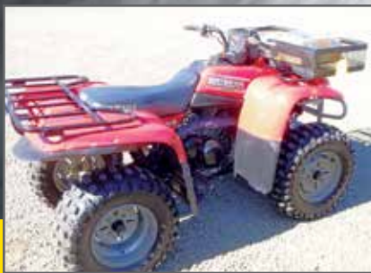
2001 YAMAHA BIG BEAR 400