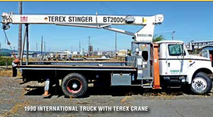
1990 INTERNATIONAL TRUCK WITH TEREX CRANE

All Day Preview: Saturday, October 17 from 9:00 A.M. to 5:00 P.M. & 2 Hours Prior to the Sale on Sunday