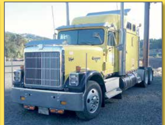
1996 INTERNATIONAL EAGLE 9300

No Reserves – All Items Sell to Highest Bidder