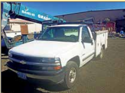
2000 CHEVROLET 2500 WITH SERVICE BODY AND LUMBER RACK

Exercise Equipment Incl. Monarch, Nautilus, Life Fitness and Schwinn. Fire Hydrant. FRIGIDAIRE Washer/Dryer Set. GALAXY Side-By-Side Fridge/Freezer. Gold Dredge. Hydraulic Pallet Jacks. LANG Commercial Two-Burner Electric Cooktop. NEW Automotive Parts Incl. Ignition Components, Filters, Belts, Bearings, Brake Parts and More. NU VU Stainless Steel Commercial Proofer and Oven. Pallet Racking. PFAFF Commercial Sewing Machine. Pickup Flat Bed. Pickup Service Body. Pool Table. Portable Band Saw Mill. SEA EAGLE 300X Kayak. SELGO Vertical Cardboard Baler. Steel 8x8 Safety Storage Building. Tail Blocks. THULE Roof Storage Box. Trailer Axles. Trailer Mounted Gas-Powered Rock Drill. Vintage Claw Foot Bathtub. Western Saddle, Lariats and Horse Tack.