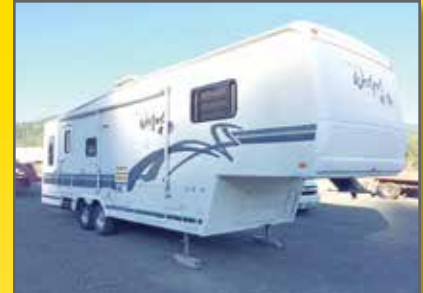
1997 WESTPORT AVION 335D WITH (2) SLIDES