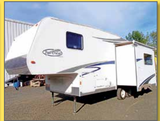
2007 TRAILMASTER TC-524RK