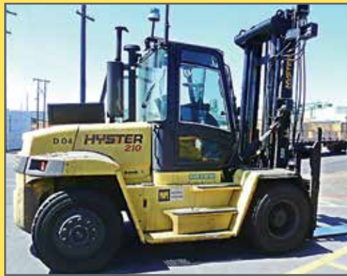
2005 HYSTER H210HD