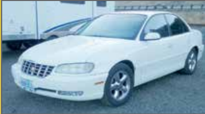
1998 CADILLAC CATERA