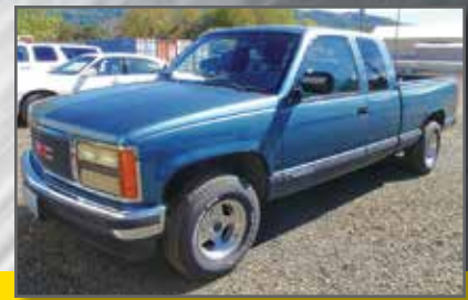
1992 GMC SIERRA 1500

1995 STRICK 45ft 2-Axle Trailer with Peeler Core Bunks. 1989 CARRIER Horse Trailer. 1986 CIRCLE J 2-Horse Trailer. 1981 WW 6x16 2-Axle Stock Trailer. 16ft 3-Axle Gooseneck Equipment Trailer with Ramps. 3 x 10 Single-Axle Utility Trailer. 4 x 8 Single-Axle Utility Trailer. 5 x 10 Single-Axle Utility Trailer with Ramp. 5 x 6 Single-Axle Tilt Deck Utility Trailer. 7 x 14 Single-Axle Flatbed Trailer with Beavertail and Ramps. CLEMENT 32ft End Dump with High Lift Gate. GREAT NORTHERN 14,000-Lb. 2-Axle Tilt Deck Trailer. NEW GLIDE HS Built 6 x 12 Single-Axle Utility Trailer with Ramp. WELLS CARGO 18ft 2-Axle Enclosed Trailer. WESTERN 40ft Spread-Axle Flat Bed Trailer.