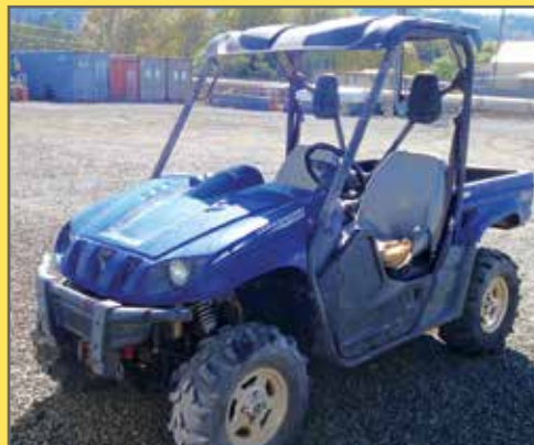
2008 YAMAHA RHINO ATV