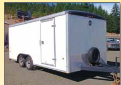
WELLS CARGO ENCLOSED TRAILER

For Additional Details Visit Our Website www.I-5auctions.com