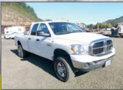
2007 DODGE 2500 DIESEL 4X4 CREW CAB