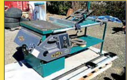
ROJEK PK300 SLIDING TABLE SAW