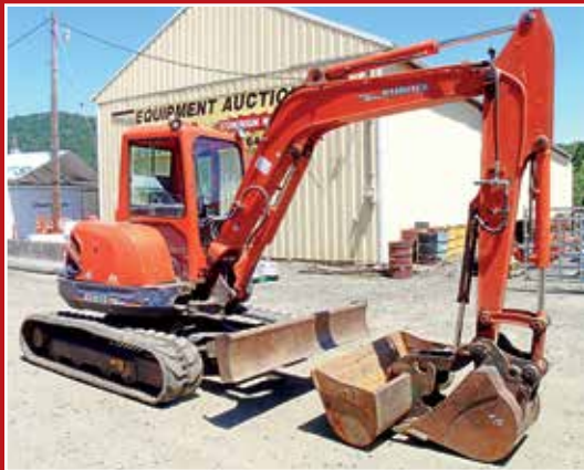
KUBOTA KX161 EXCAVATOR

Heavy Equipment, Trucks, Trailers, Vehicles, Farm Equipment, Machine Shop, Tools & More