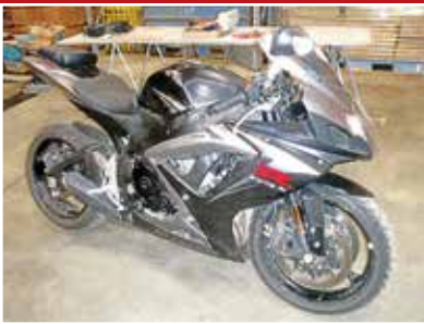
2007 SUZUKI GSX600R