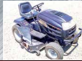
GOLD YARD MACHINE LAWN MOWER

10' Spring Tooth Harrow. 14' Cattle Guard. 14' Chain Link Gate. 5' BUSH HOG Rotary Mower. 5' Offset Disc. BRABER TR300 Tedder Rake. DEARBORN 3-Point Two-Bottom Plow. EZ-LOAD Hydraulic Front End Loader Attachment. FORD 8' 3-Point Rock Rake. FORD 903 3-Point Post Hole Auger with 8" and 12" Auger Attachments. HESSTON PT7 Pull Type 7' Mower Conditioner. JOHN DEERE 1460 9' Pull Type Disc Mower Conditioner. JOHN DEERE 3-Point Sickle Bar Mower. JOHN DEERE 660 Pull Type Side Delivery Hay Rake. JOHN DEERE 6600 Combine with 16' Header. JOHN DEERE Quick Attach Front End Loader Forks.