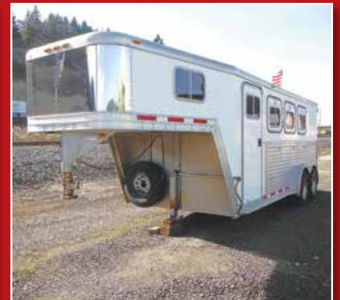
2000 FEATHERLIGHT 3H TRAILER WITH TACK ROOM

No Reserves – All Items Sell to Highest Bidder