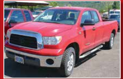
2007 TOYOTA TUNDRA