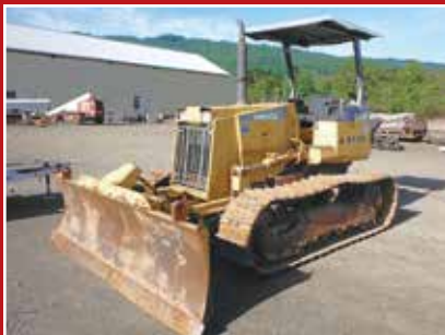
KOMATSU D31P BULLDOZER WITH 6-WAY BLADE