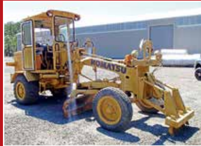
KOMATSU GD200A GRADER

BAYLINER Victoria 26' Cabin Cruiser. FREEDOM 170XL 17' Boat with Trailer. KLAMATH 12' Aluminum Boat with Trailer.