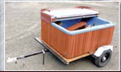
HOT SPOT HOT TUB ON TRAILER