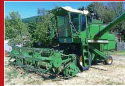
JOHN DEERE 6600 COMBINE

HOT SPOT Spa on Single Axle Utility Trailer. Pull-Behind 30-Gallon Poly Spray Tank. Pull-Behind Lawn Aerator for a Lawn and Garden Tractor. Red Bricks; Shop Vacs. TROY BUILT Bronco Riding Lawn Mower with 42" Deck. Vinyl Windows. WHEEL HORSE UNIDRIVE Commando Riding Lawn Tractor with a 36" Deck.