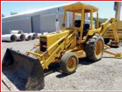
FORD 555 TRACTOR LOADER BACKHOE