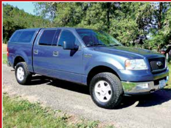
2004 FORD F-150 XLT 4X4 CREW CAB WITH CANOPY