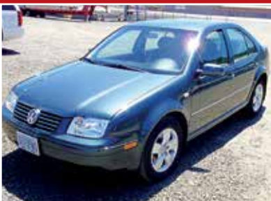
2004 VW JETTA TDI