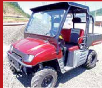
2007 POLARIS RANGER ATV

No Reserves – All Items Sell to Highest Bidder A 10% BUYER'S PREMIUM APPLIES