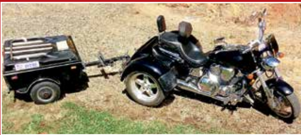
< 2003 HONDA VTX1800C WITH TRAILER