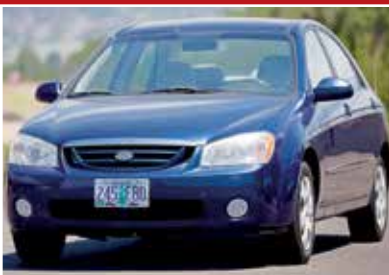
2005 KIA SPECTRA