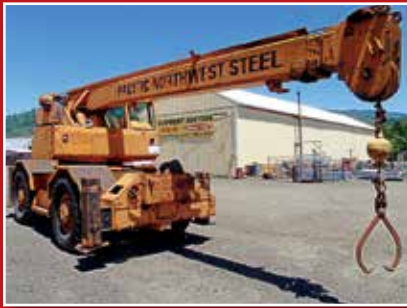
GROVE RT60 ROUGH TERRAIN CRANE