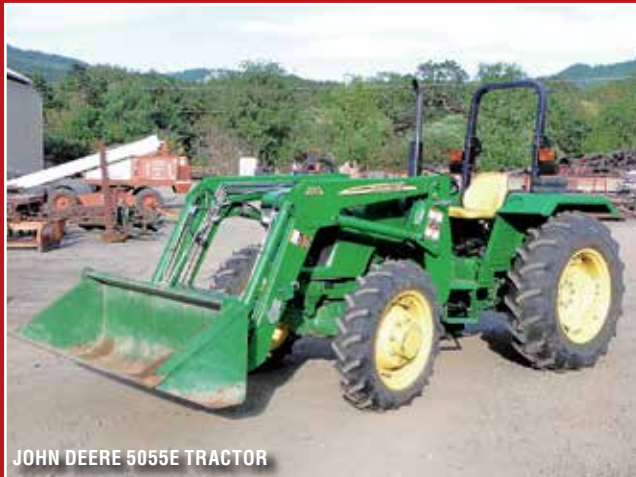
JOHN DEERE 5055E TRACTOR

Heavy Equipment, Trucks, Trailers, Vehicles, Farm Equipment, Machine Shop, Tools & More