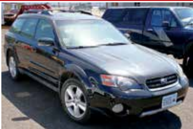
2005 SUBARU WAGON