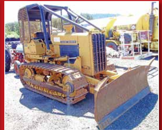
JOHN DEERE 550 BULLDOZER