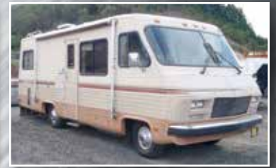
1986 PACE ARROW 27FT MOTOR HOME