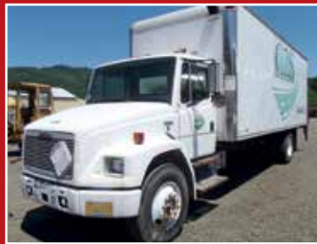
> 1995 FREIGHTLINER FL70 VAN