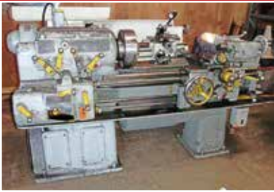
MONARCH 14X36 ENGINE LATHE