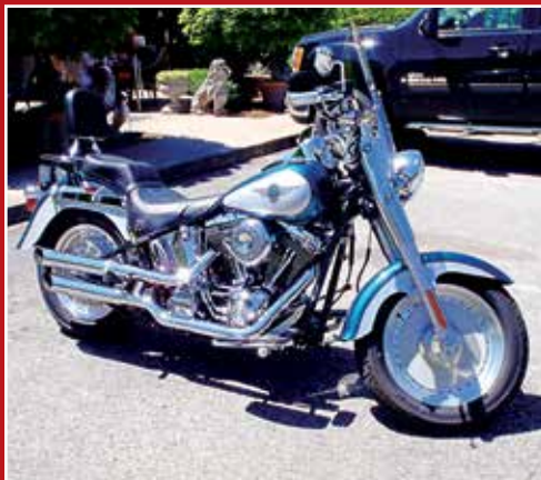
2004 HARLEY DAVIDSON FAT BOY – LOW MILES