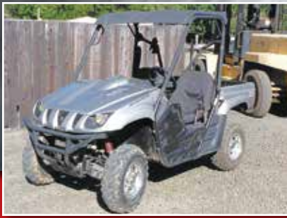
2008 RHINO 700