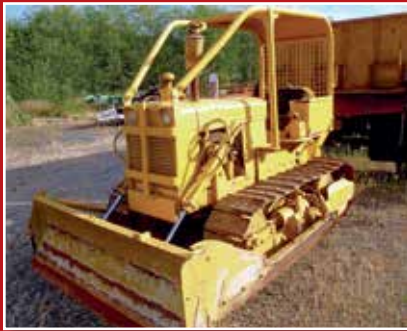
CASE 310 WITH CARGO WINCH