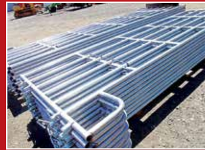
NEW GALVANIZED LIVESTOCK PANELS