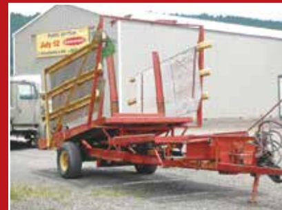
NEW HOLLAND 1002 STACKLINER BALE WAGON

KIMCO 9300 Vineyard Tiller. Livestock Squeeze Chute. MASSEY FERGUSON 6' 3-Point Rear Blade. Mineral Feeder. NEW 12', 14' & 16' 3A Livestock Supply Galvanized Livestock Panels. NEW 3A Livestock Supply 12', 14' & 16' Gates. NEW 3A Livestock Supply 6' Galvanized Bow Gate. NEW 9-Panel Round Pen with 6' Gate. NEW HOLLAND Stackliner 1002 Bale Wagon. PACOFLO 9000 Water Booster System. TERRABOND 6' 3-Point Spreader Grader. Vintage NEW OSBORNE Sickle Bar Mower. Vintage Two-Bottom Plow.