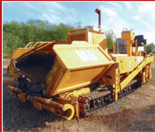
BLAW KNOX PF400A ASPHALT PAVER