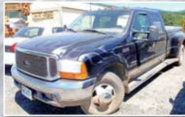
1999 FORD F-350 SUPER DUTY DIESEL EXTENDED CAB DUALY