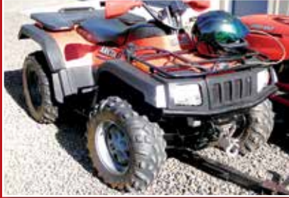
2003 ARCTIC CAT ATV