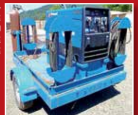
MILLER BOBCAT 250 WELDER GENERATOR