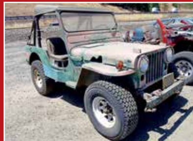
1952 WILLY'S JEEP