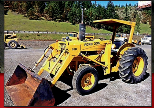
FORD 335 DIESEL TRACTOR