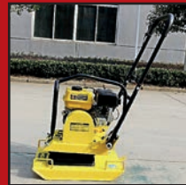
NEW LONCIN MS20 PLATE COMPACTOR