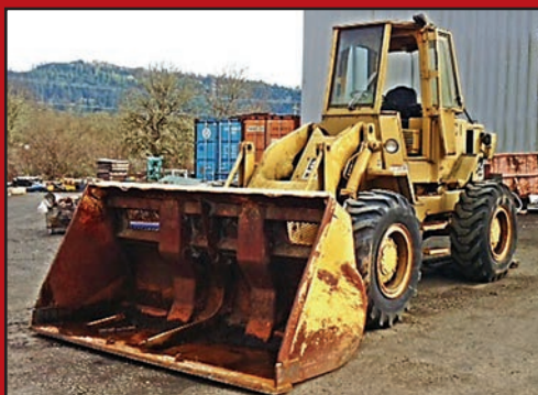
CAT 930 FRONT END LOADER