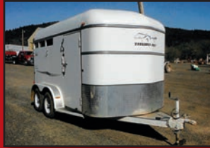
2011 THURO-BILT SHILO EX 2-HORSE SLANT TRAILER WITH TACK ROOM