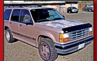
1993 FORD EXPLORER 4X4