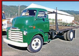
1948 CHEVROLET CABOVER FB TRUCK