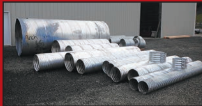
NEW GALVANIZED CULVERT

2000 FREIGHTLINER Legacy. 1996 KENWORTH 4-Axle. 1980 GMC 7000 Flatbed. 1972 INTERNATIONAL Cab and Chassis with 3208 CAT Diesel. 1978 INTERNATIONAL Loadstar 5-Yard Dump Truck. 1989 FORD L7000 Diesel 5-Yard Dump Truck. 1974 WHITE Western Star Water Truck. 1974 WHITE Western Star Lube Truck.