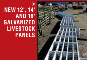
NEW 12', 14' AND 16' GALVANIZED LIVESTOCK PANELS

No Reserves – All Items Sell to Highest Bidder