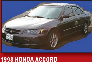
1998 HONDA ACCORD