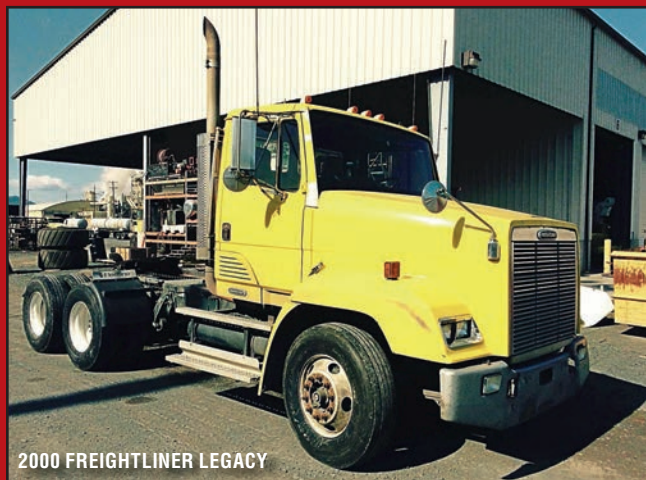
2000 FREIGHTLINER LEGACY

Heavy Equipment, Trucks, Trailers, Vehicles, Farm Equipment, Machine Shop, Tools & More