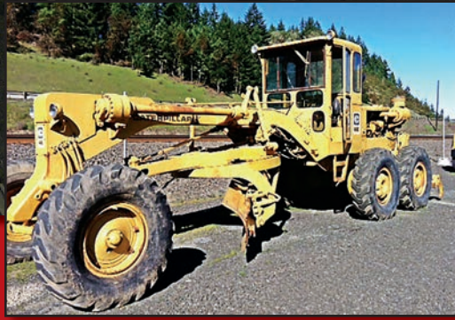
CAT 14E GRADER

JLG 80HX 80' Manlift with Hydraulic Telescopic-Axes. Towable Gas Powered Mortar Mixer. Assorted NEW Galvanized Culvert. (2) NEW LONCIN MS10 6.5 HP Plate Compactors. (2) NEW LONCIN MS20 6.5 HP Plate Compactors. (2) NEW LONCIN MS100 6.5 HP Plate Compactors. NEW LONCIN MS160 Reversible 6.5 HP Plate Compactor. NEW LONCIN MS330 Reversible Plate Compactor. NEW LONCIN LTR72 6.5 HP Jumping Jack. Electric Cement Mixer.