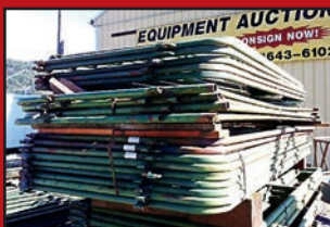
BIG VALLEY STOCK PANELS