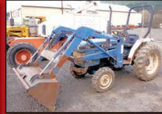
FORD 1715 4X4 DIESEL TRACTOR WITH FRONT END LOADER