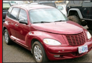
2002 CHRYSLER PT CRUISER