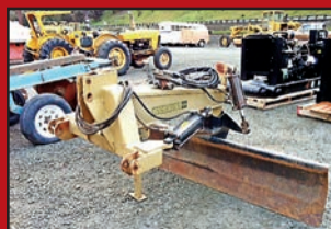
LAND PRIDE 9' REAR BLADE