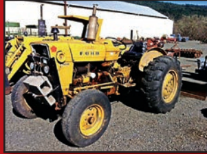
FORD 4400 DIESEL WITH PTO