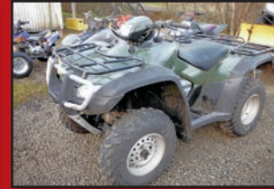
2006 HONDA FOREMAN 400 4X4