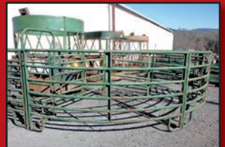
BIG VALLEY TUB SWEEP