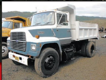
1989 FORD L7000 DUMP TRUCK