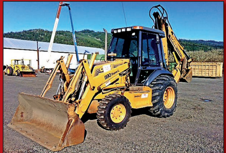
CASE 590 SL II TLB 4X4 WITH EXTENDAHOE HYDRAULIC AUMULET THUMB