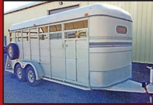
MORGAN BUILT STOCK TRAILER