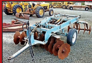
ALLIED 9' TANDEM OFFSET DISC