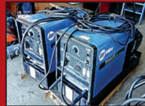
(2) MILLER BOBCAT 225G WELDER GENERATORS