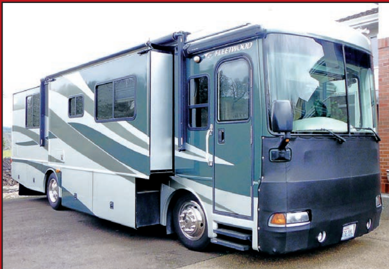
2004 FLEETWOOD MODEL H MOTORHOME

Heavy Equipment, Trucks, Trailers, Vehicles, Farm Equipment, Machine Shop, Tools & More