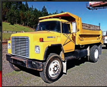
1978 INTERNATIONAL DUMP TRUCK