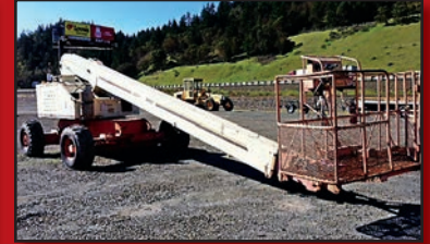
JLG 80HX MANLIFT