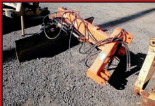
LAND PRIDE HEAVY DUTY 3-PT. 7' REAR BLADE WITH HYDRAULICS