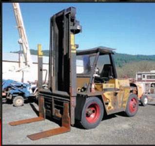
CAT V200 20,000-LB. DIESEL FORKLIFT