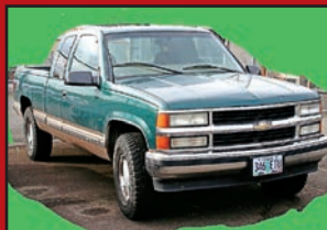
1997 CHEVROLET Z-71