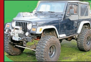
2002 JEEP WRANGLER