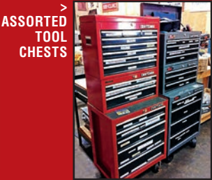
ASSORTED TOOL CHESTS

2002 JEEP Wrangler. 2002 CHEVROLET 3500 Passenger Van. 2000 ACURA Sedan. 1999 FORD Taurus. 1999 JEEP Cherokee. 1999 HONDA Civic. 1998 HONDA Accord. 1997 CHEVROLET Corvette. 1997 BUICK LeSabre. 1993 FORD Explorer 4x4. 1989 FORD Bronco II. 1986 CHEVROLET Camaro Z28 IROC. 1977 JEEP Renegade.