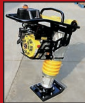
NEW LONCIN LTR72 JUMPING JACK