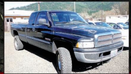
1999 DODGE RAM 2500 LARAMIE SLT 4X4 DIESEL