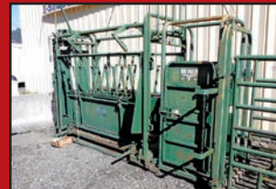
BIG VALLEY SQUEEZE CHUTE AND SCALES