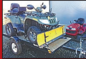
2006 ARCTIC CAT TRV500