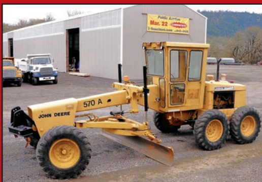
JOHN DEERE 570A GRADER WITH RIPPERS