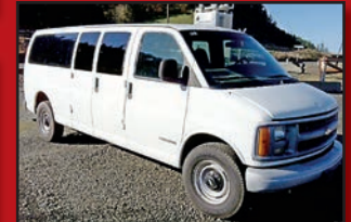
2002 CHEVROLET 3500 PASSENGER