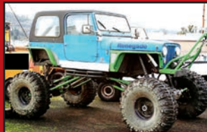
1977 JEEP RENEGADE