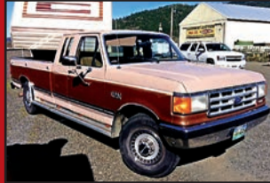
1987 FORD F-250