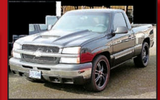
2003 CHEVROLET SILVERADO