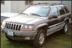
1999 JEEP GRAND CHEROKEE