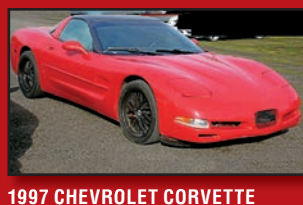
1997 CHEVROLET CORVETTE