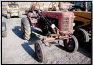
INTERNATIONAL HARVESTER MODEL A TRACTOR