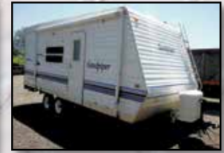
2004 SANDPIPER T21 TOY HAULER