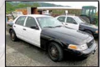
2008 FORD CROWN VIC

CRAFTSMAN 3 HP 10" Table Saw. CRAFTSMAN 6" Bench Grinder. CRAFTSMAN 3.5 HP Tank-Mounted Air Compressor. CRAFTSMAN 3.5 HP 16-Gallon Wet/Dry Shop Vac. MONTGOMERY WARD Power Craft 10" Radial Arm Saw and More.