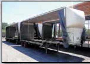
(1 OF 2) COMET DOUBLE CURTAIN VANS