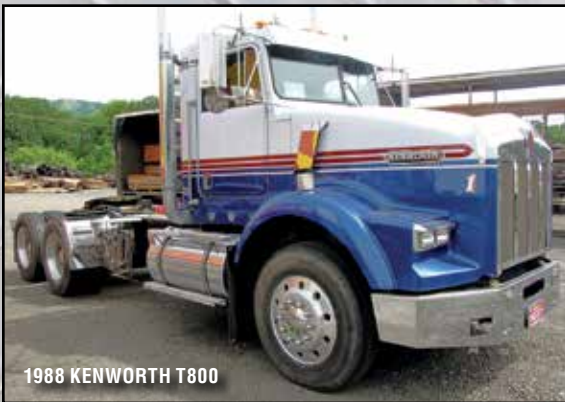
1988 KENWORTH T800

Heavy Equipment, Trucks, Trailers, Vehicles, Farm Equipment, Machine Shop, Tools & More