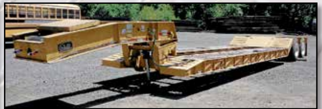
2003 WITZCO CHALLENGER RG35 LOWBOY (NEW)