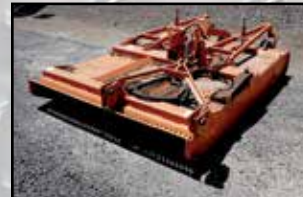
TIGER TM HEAVY DUTY 6' ROTARY CUTTER