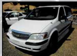
2003 CHEVY ENTERVAN - WHEELCHAIR ACCESSIBLE