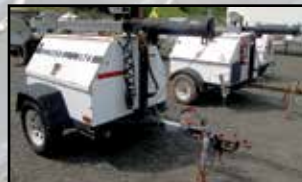
PORTABLE DIESEL LIGHT-GENERATOR PLANTS