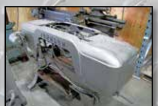
JOHNSON HORIZONTAL BAND SAW