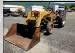
MASSEY FERGUSON MF65 DIESEL W/FRONT-END LOADER