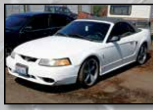
1999 FORD MUSTANG CONVERTIBLE