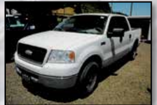
2006 FORD F-150 CREWCAB 4X4