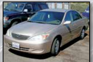
2004 TOYOTA CAMRY