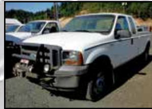
2005 FORD F-250 W/POWER STROKE DIESEL AND WARN WINCH