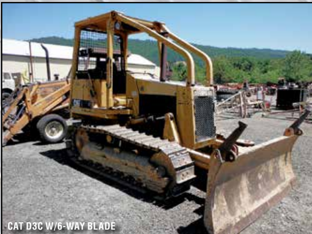
CAT D3C W/6-WAY BLADE

Auction Location: 121 Deady Crossing Sutherlin, Oregon 97479