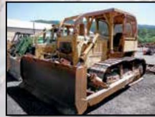
CAT D6C W/POWER TILT BLADE AND WINCH