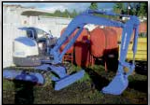
MTSUBISHI MM30 CR MINI EXCAVATOR