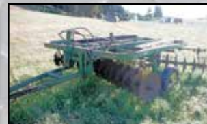
JOHN DEERE 110 TANDEM OFFSET DISC