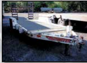
TOWMASTER 18' TANDEM-AXLE EQUIPMENT TRAILER W/RAMPS