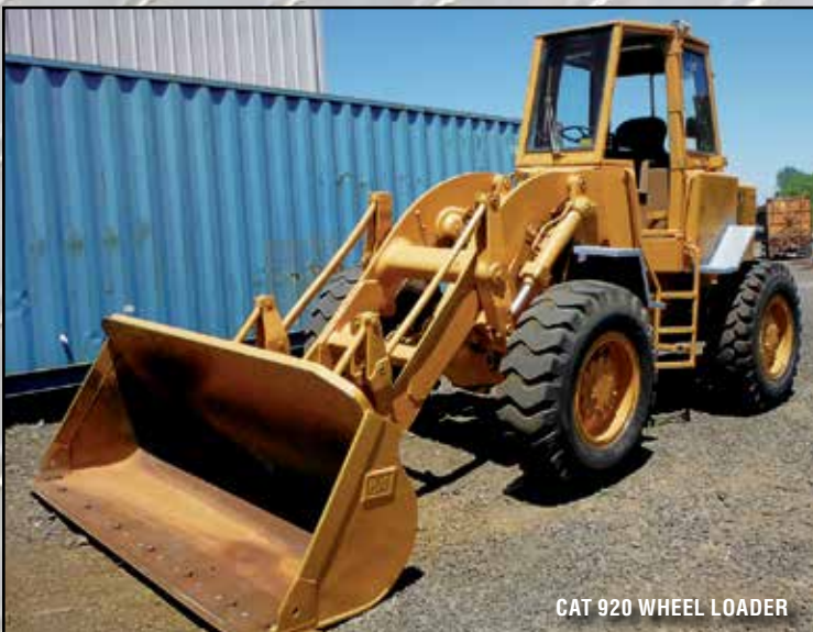
CAT 920 WHEEL LOADER