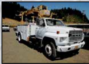
1980 FORD F-800 W/PITMAN POLE CRANE AND AUGER