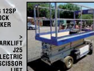
MARKLIFT J25 ELECTRIC SCISSOR LIFT