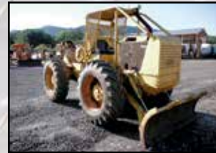
MOUNTAIN LOGGER MODEL BB SKIDDER