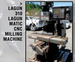
LAGUN 310 LAGUN MATIC CNC MILLING MACHINE