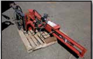
SHAVER HD8 HYDRAULIC POST POUNDER