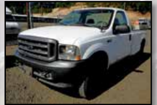
2004 FORD F-250 W/DIAMOND PLATE TOOL BOXES