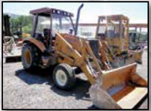
CASE 580K TRACTOR LOADER SCRAPER

1996 FREIGHTLINER 3-Axle Truck. (2) 1990 INTERNATIONAL School Buses. 1988 KENWORTH T800 3-Axle Truck. 1983 KENWORTH 3-Axle Truck. 1980 FORD F-800 2-Axle Truck, w/a Pitman Polecat PC-1300 pole boom, w/auger. 1975 CHEVY C60 2-Axle Truck, w/a Cascade compact knuckle boom hydraulic crane. 1972 FORD F-700 2-Axle Truck, w/dump bed. 1969 INTERNATIONAL TRANSTAR 400 3-Axle Water Truck.