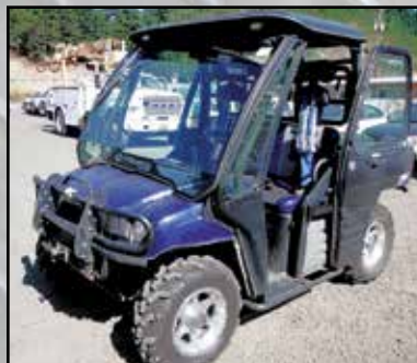
2005 POLARIS RANGER XP700