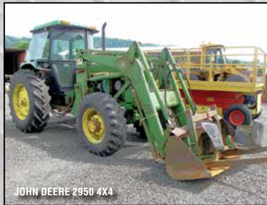
JOHN DEERE 2950 4X4