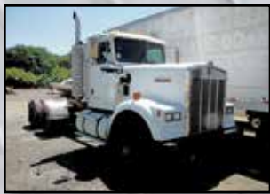
1983 KENWORTH 3-AXLE TRUCK