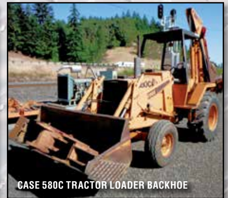
CASE 580C TRACTOR LOADER BACKHOE

No Reserves – All Items Sell to Highest Bidder