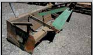
JOHN DEERE 3-POINT BOX SCRAPER