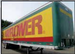
1992 FRUEHAUF 48' MOVING VAN