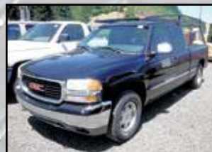
2000 GMC EXTENDED CAB