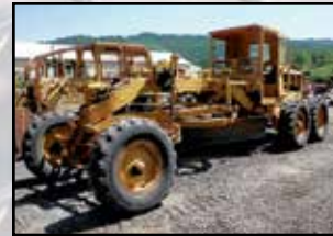
CAT 7 GRADER