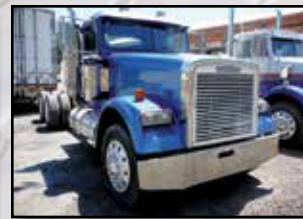
1996 FREIGHTLINER 3-AXLE TRUCK