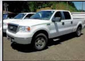
2007 FORD F-150 CREWCAB 4X4