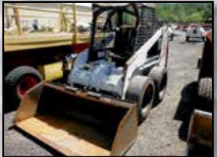
BOBCAT S130 SKIDSTEER LOADER