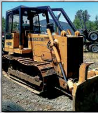
CASE 1150B W/6-WAY BLADE, WINCH AND ARCH