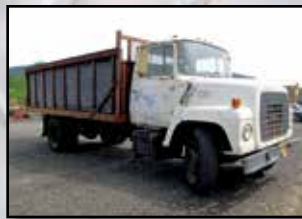
1972 FORD F-700 DUMP TRUCK