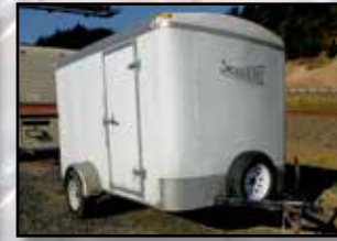
ROADRUNNER 6X12 SINGLE-AXLE ENCLOSED TRAILER