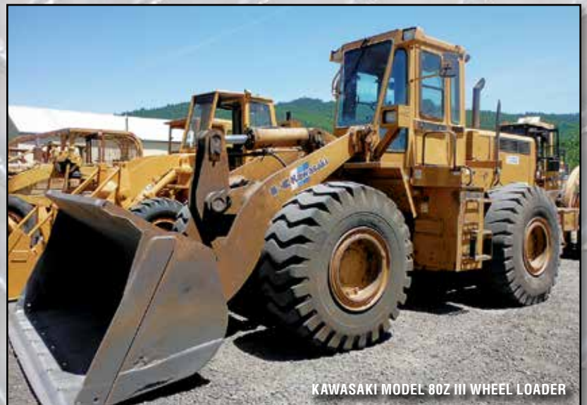
KAWASAKI MODEL 80Z III WHEEL LOADER

For Additional Details Visit Our Website www.I-5auctions.com